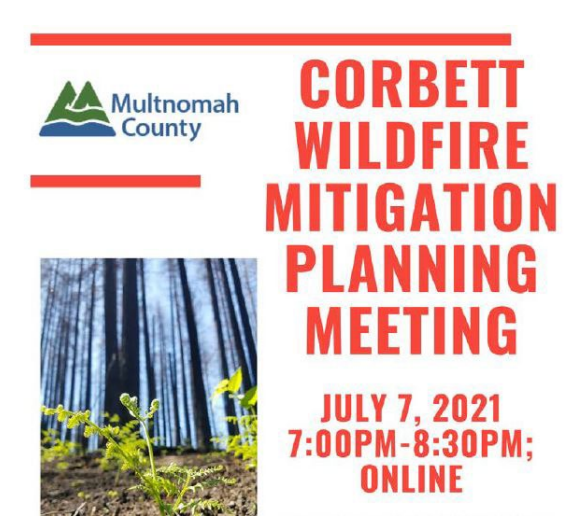
Figure 9 - A flyer for a wildfire mitigation meeting held during the plan update process.

The COVID-19 pandemic restructured public engagement, with in-person meetings replaced by online meetings. Opportunities to meet with neighborhood and community groups to discuss the project and to collect additional information from residents, and public engagement efforts by local fire districts, were ongoing. A more comprehensive public engagement process regarding the plan update is planned for later in 2023.