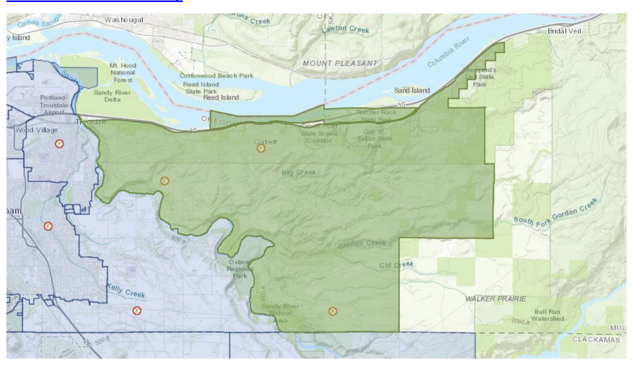
Figure 52 - Location of Corbett Fire's service area, with the main station shown in the north center part of the area. Map from the Oregon Office of the State Fire Marshal.

Corbett Fire's service area has steep slopes and homes surrounded by heavy fuels adjacent to numerous state parks, large private timber tracts, and Bureau of Land Management and US Forest Service holdings. Based on the statewide WUI hazard rating generated by ODF, Corbett Fire's service area includes nearly all of the highest risk WUI areas in Multnomah County. The