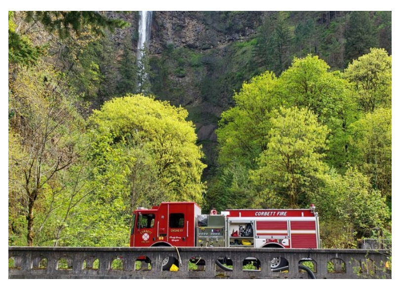
Figure 55 - Corbett Fire Engine 61 at Multnomah Falls.

Corbett Fire has a staff of two part-time employees and 30 volunteers as of June 2023, creating a strong level of response capacity for the population served.