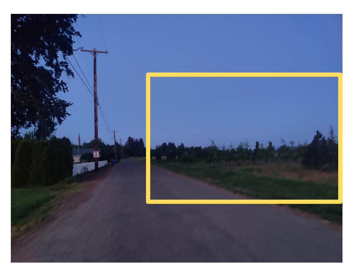
Looking at PWB site - This area will have a glow in the night sky landscape from the MANY MANY 24/7 lights at the facility.