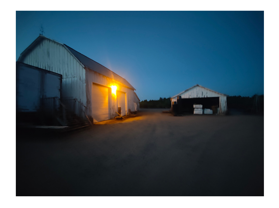
Light on R&H Barn - This light is NOT visible from anywhere except directly within a small radius. It is NOT visible from the street or from any of the residence nearby. This picture was taken on site about 50 feet away with permission of the landowner.