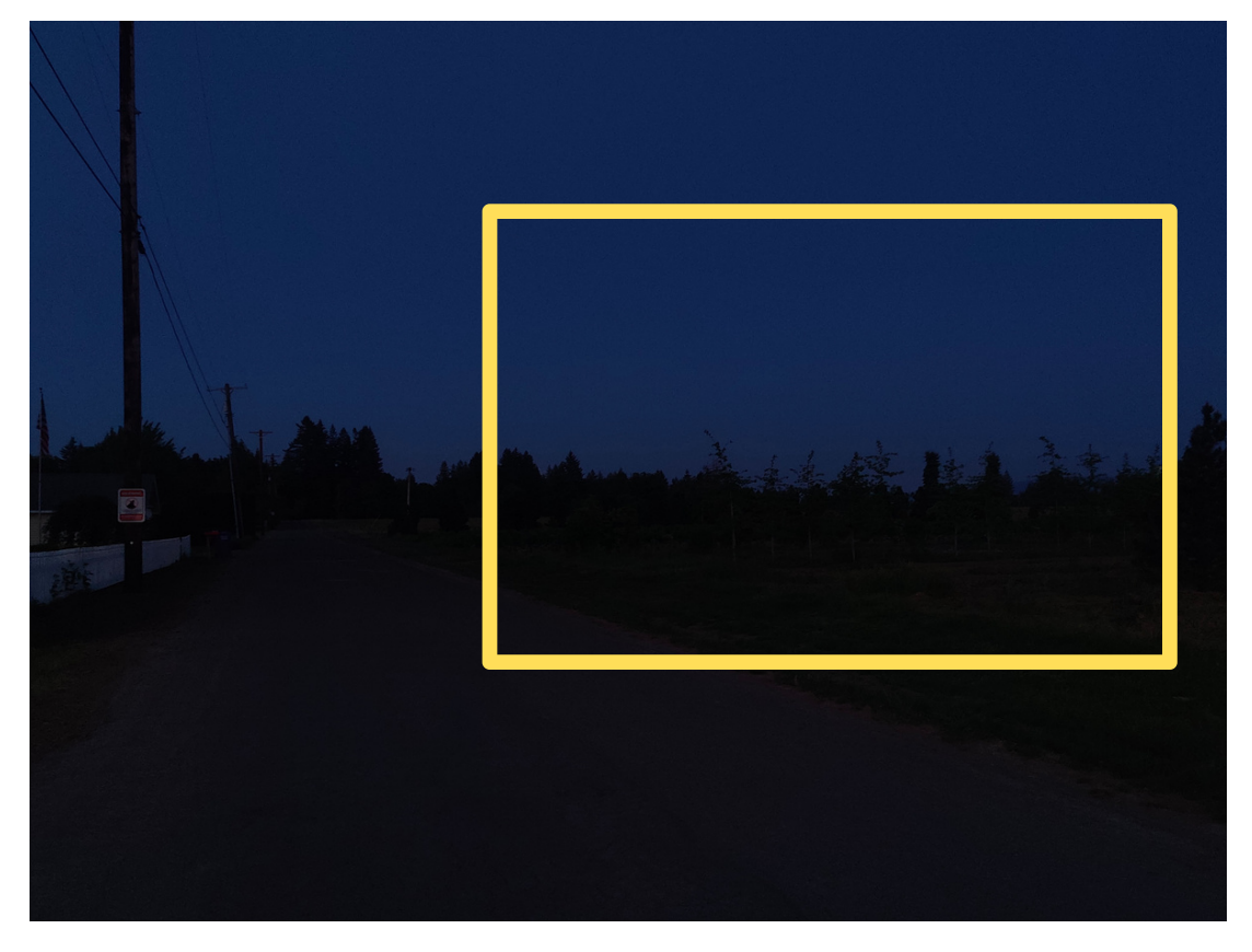
Night Sky at the PWB site - PWB plant will have multiple lights creating a glow in the night sky landscape looking East on Carpenter Lane.