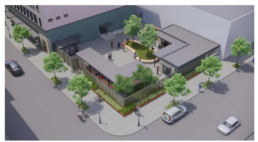
Sketch of the courtyard design for the downtown Behavioral Health Resource Center