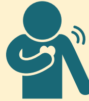
Feelings of having a fast-beating, fluttering, or pounding heart