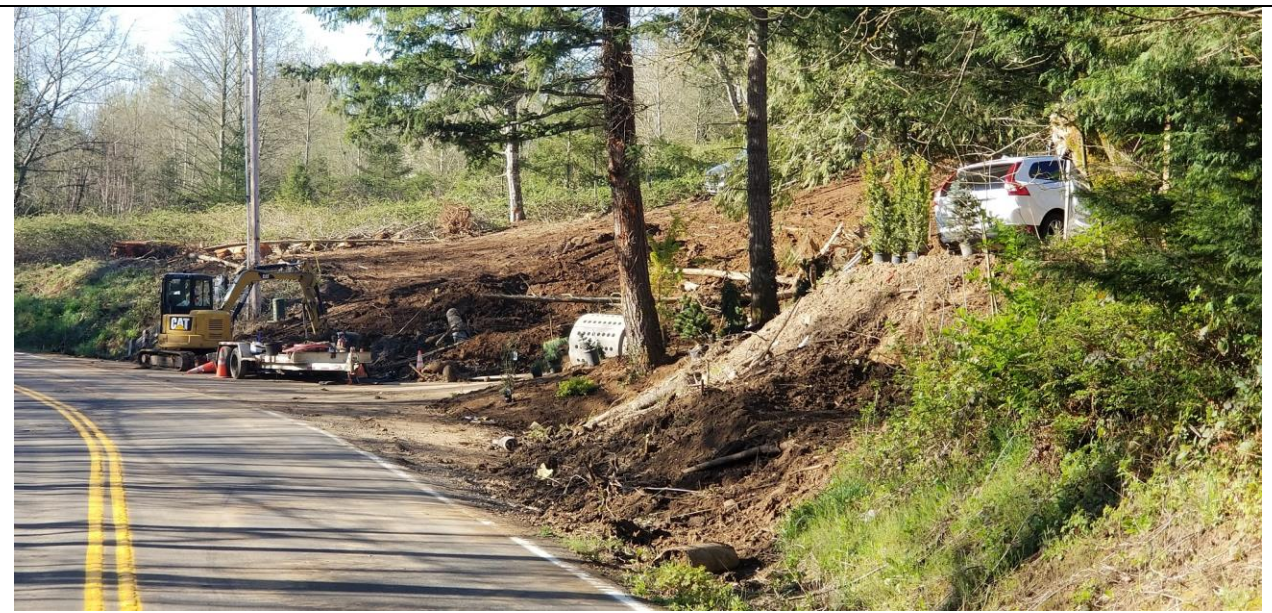
1. View of the non-permitted development activity being conducted on the property, specifically the extensive non-permitted ground disturbance, grading, site clearing and excavation work, and non-permitted development activity within a stream overlay area.