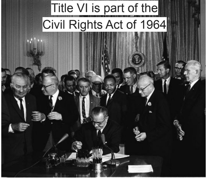
President Lyndon B. Johnson signing the 1964 Civil Rights Act, July 2, 1964.