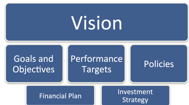
Figure 1. Elements of the Regional Transportation Plan