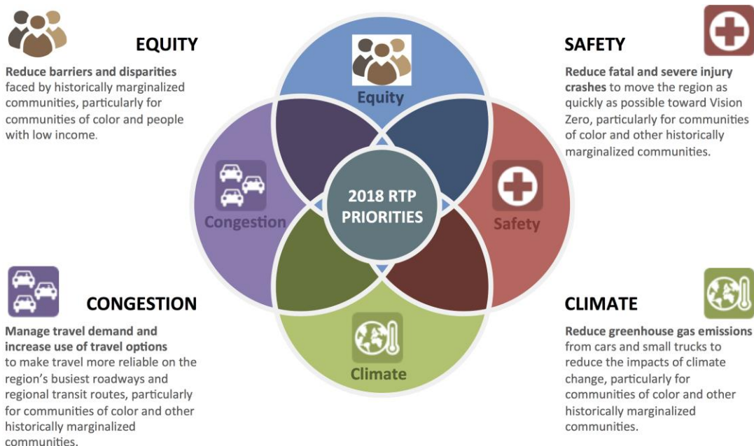
Figure 2. 2018 Regional Transportation Plan Priority Policy Outcomes

Summarized from the 2018 Regional Transportation Plan (Chapters 3 and 6)