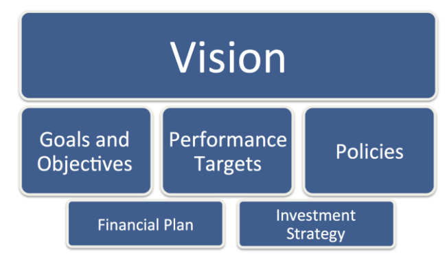
Figure 1. Elements of the Regional Transportation Plan

The plan identifies current and future regional transportation needs, investment priorities to meet those needs, and local, regional, state and federal transportation funds the region expects to have available to make those investments.