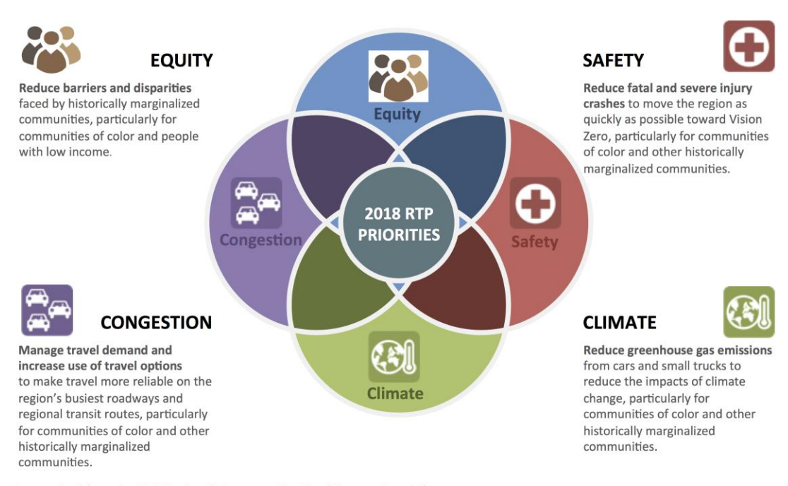
Figure 2. 2018 Regional Transportation Plan Priority Policy Outcomes

Summarized from the 2018 Regional Transportation Plan (Chapters 3 and 6)