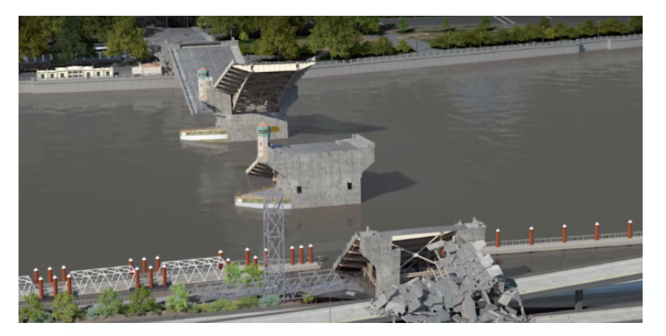
Image depicting what would happen to the Burnside Bridge during a magnitude 8+ earthquake.

Portland's aging downtown bridges are not expected to withstand a major earthquake. That is why Multnomah County is taking the lead on making at least one bridge ready to withstand the looming Cascadia Subduction Zone Earthquake. Located in the heart of downtown Portland, along a designated emergency route, the Earthquake Ready Burnside Bridge will play a critical role in disaster response and regional economic recovery.