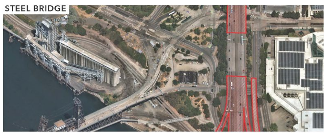
Figure 1.4-3. Seismic Vulnerability of Downtown Bridge Approaches