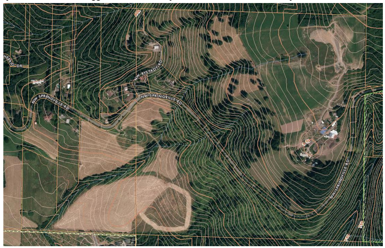
Topography of Tract

Areas of the property have a slope greater than 25%. Generally, as shown below, the eastern portion of the tract contains steeper terrain while the western portion has more gentle terrain. The County's Hillside Development ordinance is triggered when development occurs on areas with slopes 25% or more.