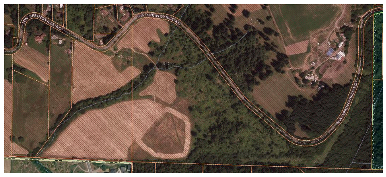
SEC-h Overlay Boundaries on Subject Tract

The map below shows that the Significant Environmental Concern for wildlife habitat overlay encompasses the entire tract.