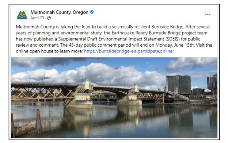
Social media post announcing the Supplemental Draft EIS public comment period on Facebook.

Publication of the Supplemental Draft EIS did not generate very much earned media coverage, presumably because outreach about the refinements to the Preferred Alternative had occurred in late 2021.