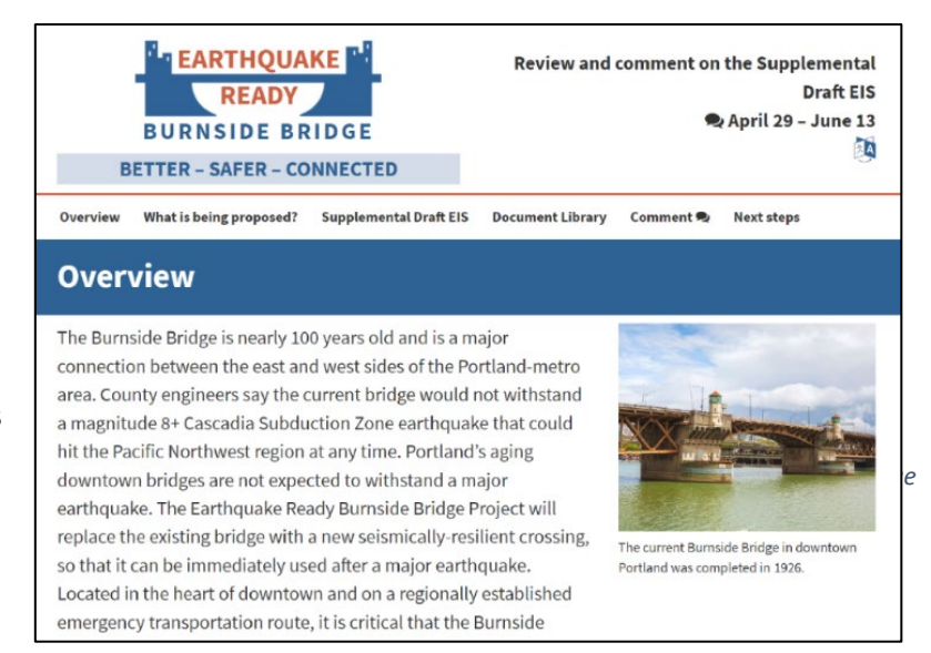
Supplemental Draft EIS Online Open House website.

Notice of the online open house was included in the project website, e-newsletters, press releases, and social media posts.