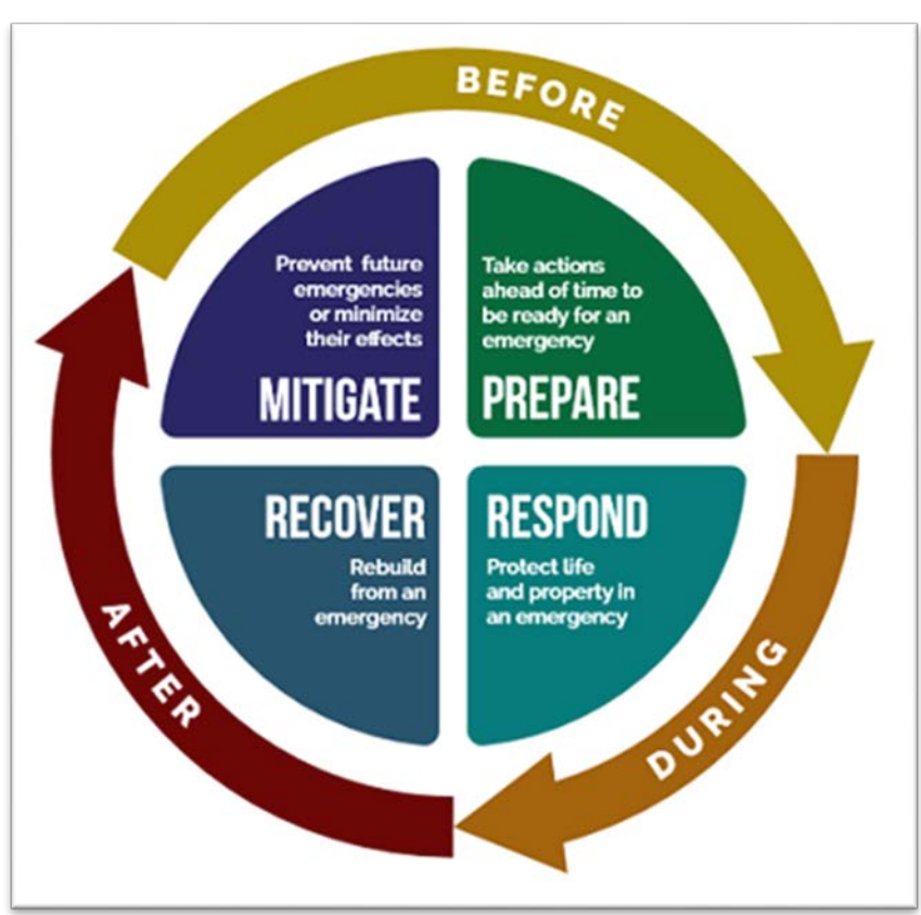
Figure 2 - FEMA Disaster Cycle showing the different timelines of emergency management.

Many natural disasters have relationships to natural landscapes, such as steep slopes, floodplains, and forests. This means that natural