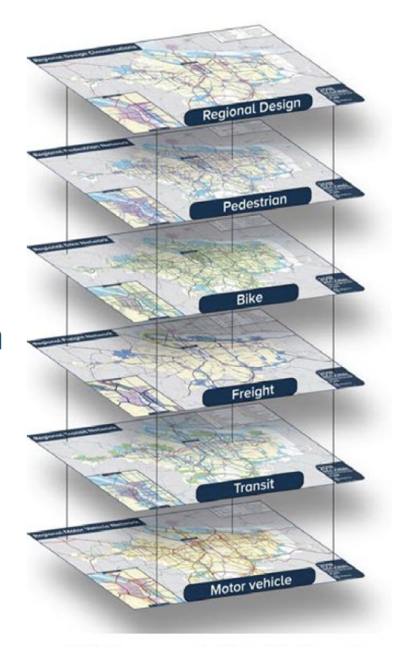
RTP Transportation Networks