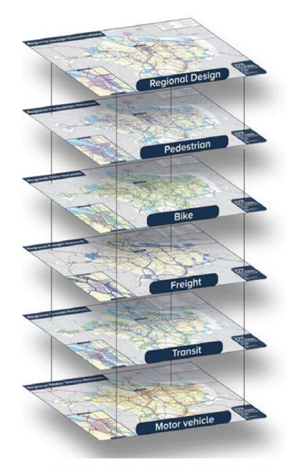
RTP Transportation Networks