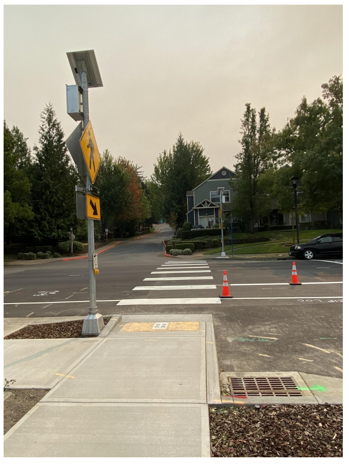
Kennedy Park Subdivision - Halsey St Mid Block Crossing