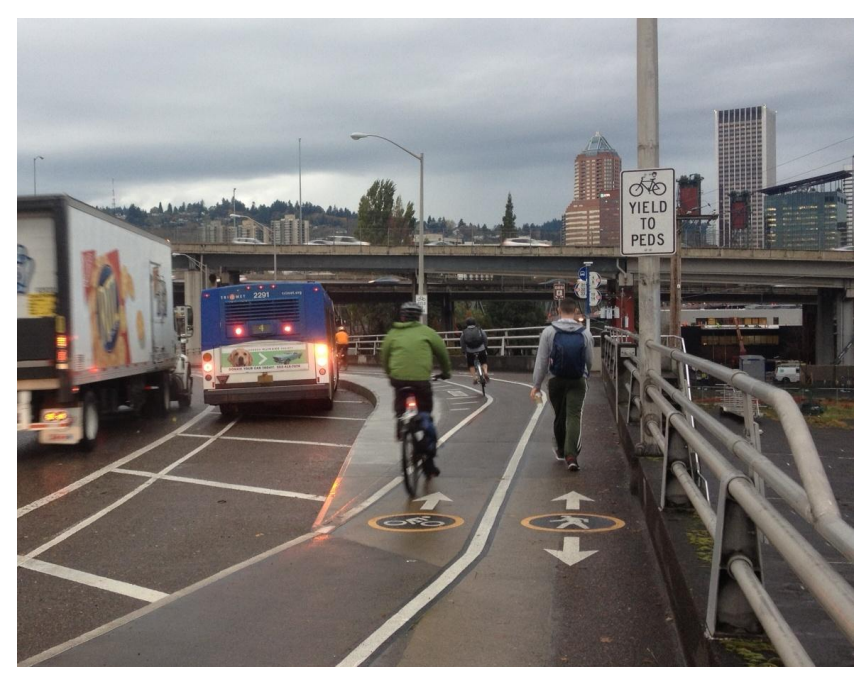
Picture of Westbound Hawthorn Bridge bus stop with bike lane and sidewalk