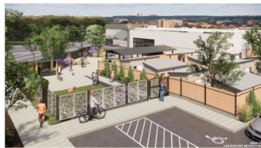
RENDERING LOOKING NORTH ON N. DENVER FROM SW CORNER OF SITE