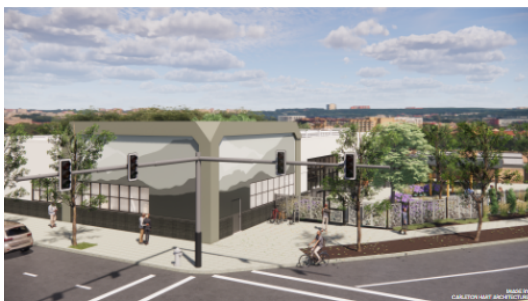
RENDERING CORNER OF N. LOMBARD AND N. DENVER (PLACEHOLDER IMAGE FOR MURAL)