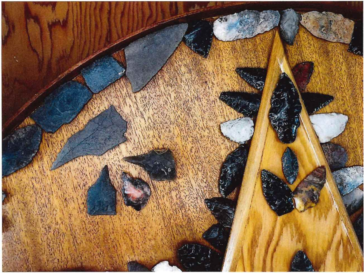
Figure 4f. Inventory #6 on Ernest Meyer's artifact list in Figure 2. Arrowheads found on the current Portland Water Bureau property. Ernest found these artifacts while plowing, tilling, and farming the ~40 acres between 1930s and 1970s.