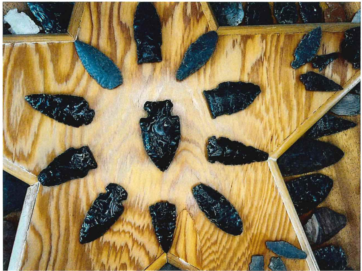
Figure 4g. Inventory #6 on Ernest Meyer's artifact list in Figure 2. Arrowheads found on the current Portland Water Bureau property. Ernest found these artifacts while plowing, tilling, and farming the ~40 acres between 1930s and 1970s.