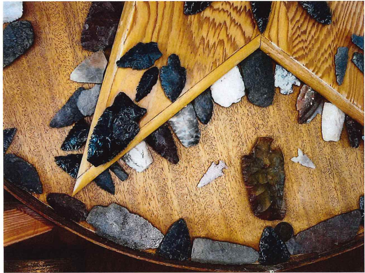
Figure 4d. Inventory #6 on Ernest Meyer's artifact list in Figure 2. Arrowheads found on the current Portland Water Bureau property. Ernest found these artifacts while plowing, tilling, and farming the ~40 acres between 1930s and 1970s.