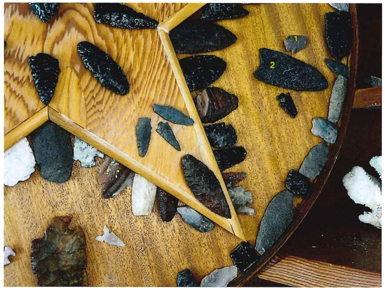
Figure 4c. Inventory #6 on Ernest Meyer's artifact list in Figure 2. Arrowheads found on the current Portland Water Bureau property. Ernest found these artifacts while plowing, tilling, and farming the ~40 acres between 1930s and 1970s. Artifacts denoted by "1" and "2" were not found on the property.