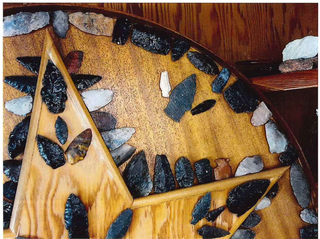
Figure 4b. Inventory #6 on Ernest Meyer's artifact list in Figure 2. Arrowheads found on the current Portland Water Bureau property. Ernest found these artifacts while plowing, tilling, and farming the ~40 acres between 1930s and 1970s.