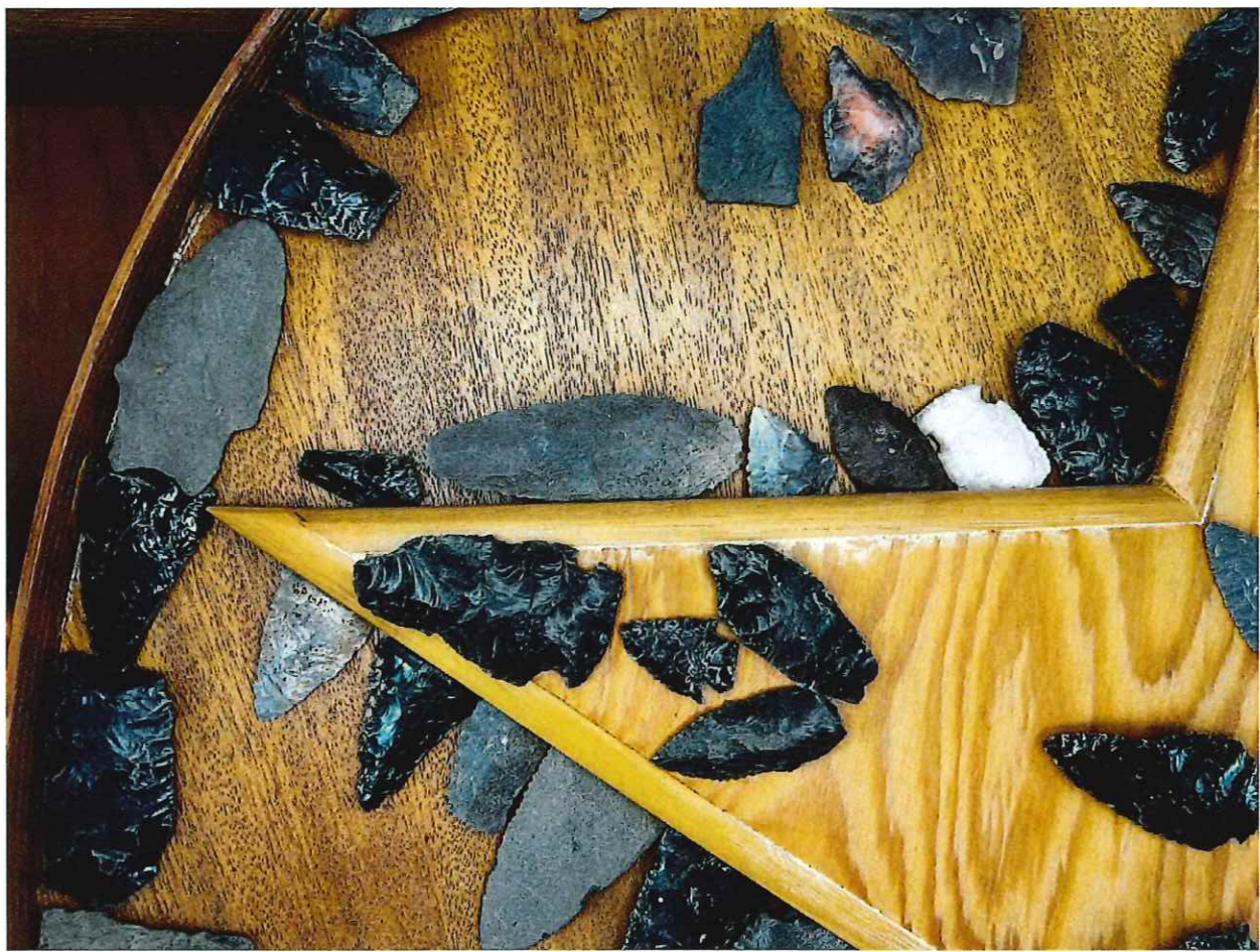
Figure 4e. Inventory #6 on Ernest Meyer's artifact list in Figure 2. Arrowheads found on the current Portland Water Bureau property. Ernest found these artifacts while plowing, tilling, and farming the ~40 acres between 1930s and 1970s.