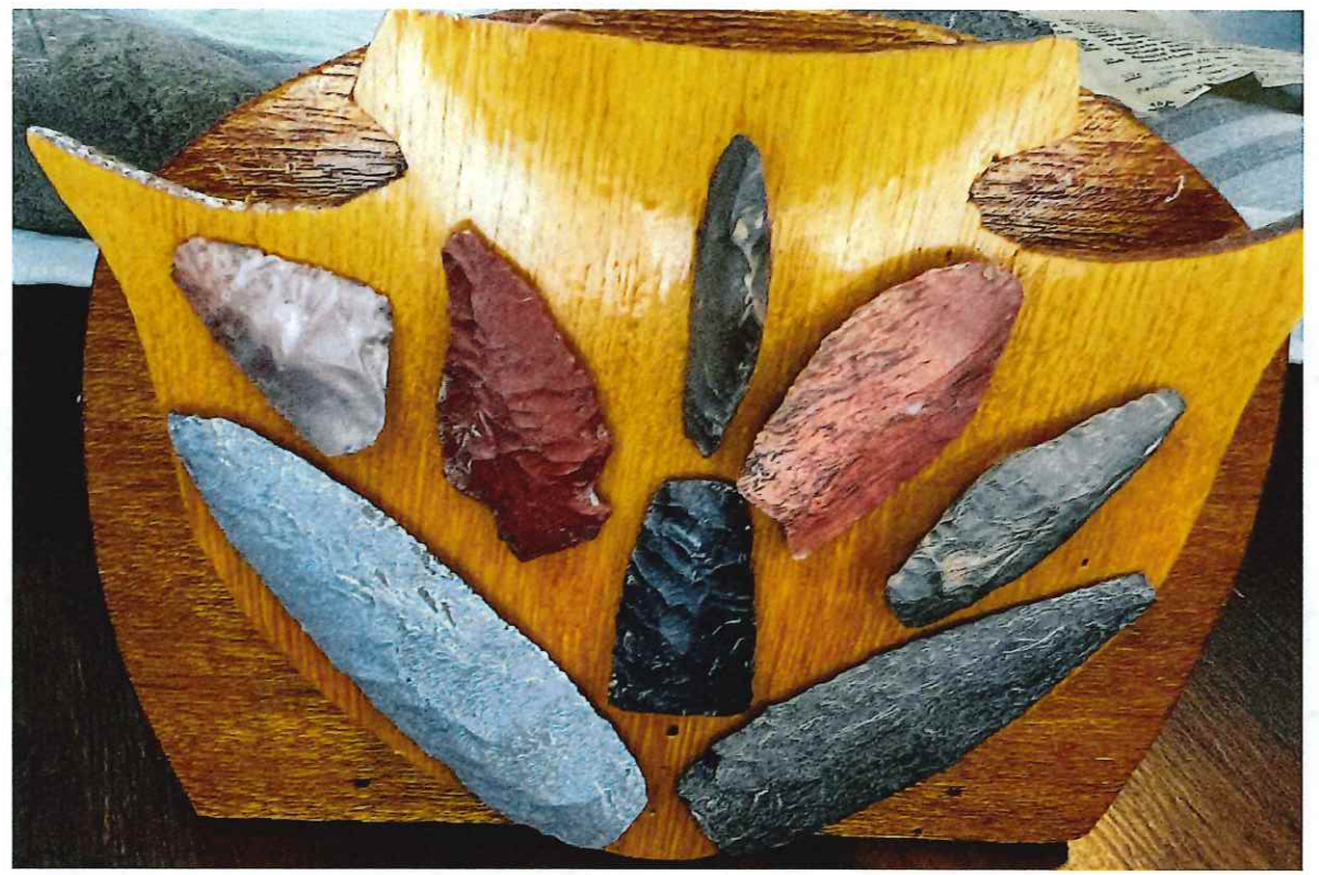
Figure 4a. Inventory #6 on Ernest Meyer's artifact list in Figure 2. Arrowheads found on the current Portland Water Bureau property. Ernest found these artifacts while plowing, tilling, and farming the ~40 acres between 1930s and 1970s.