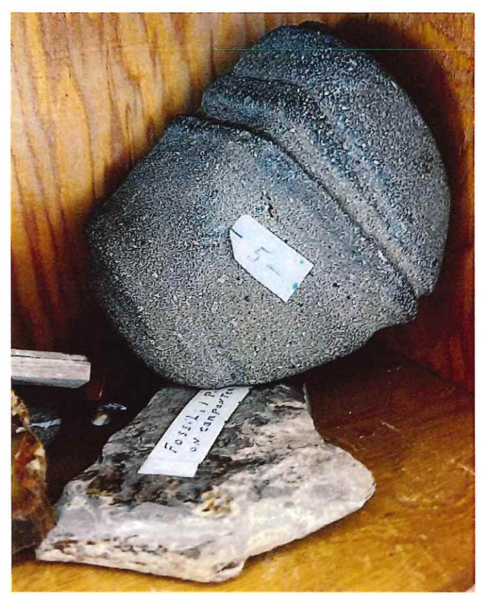
Figure 3. Inventory #5 on Ernest Meyer's artifact list in Figure 2. Rock weapon found on the grounds of the Methodist church in Boring, corner of SE Bluff Rd and SE Pleasant Home Rd.