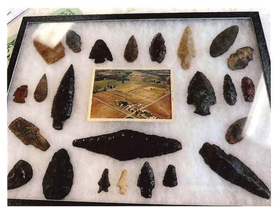
Artifacts gathered from the Carlson Farm property between 1905 and 1960. Photo is an aerial view of the Carlson Farm.