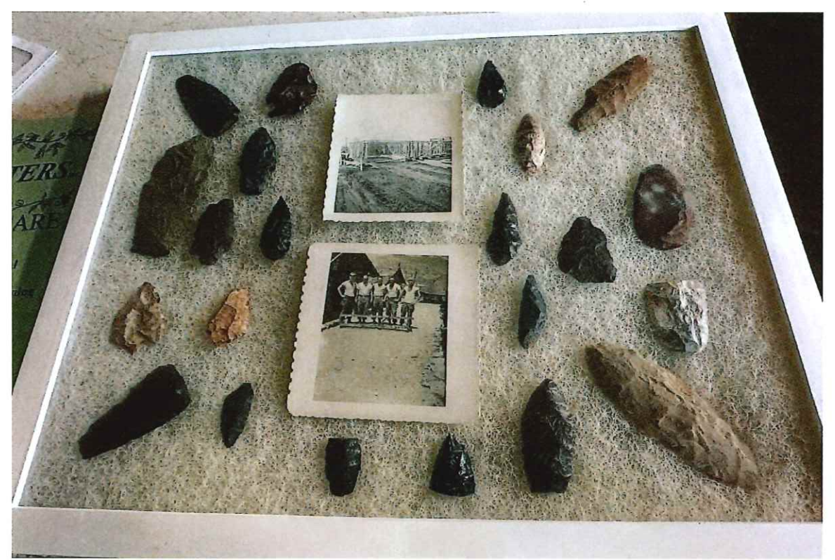
Artifacts gathered from the Carlson Farm property between 1905 and 1960. Photos show construction of the farmhouse to be completed in 1960.