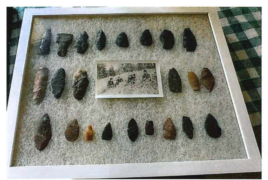
Artifacts gathered from the Carlson Farm property between 1905 and 1960.