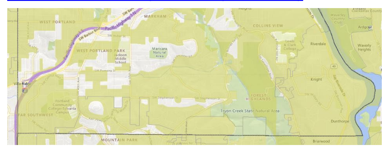
Figure 62 - Map showing WUI areas in green in Lake Oswego Fire service boundaries in Multnomah County. Most areas are considered to be in the WUI. Map from Oregon Department of Forestry statewide WUI Hazard Rating map.