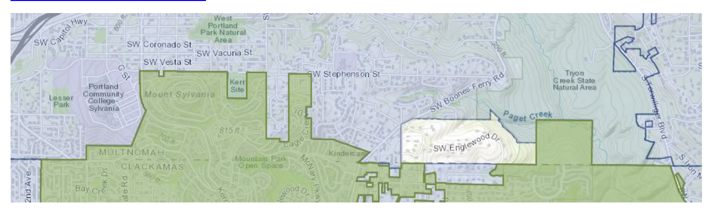
Figure 60 - Lake Oswego service areas inside of Multnomah County. The unshaded area along SW Englewood Drive is the Alto Park Water District and is also part of Lake Oswego Fire's service area. Map from the Oregon State Fire Marshal's office.