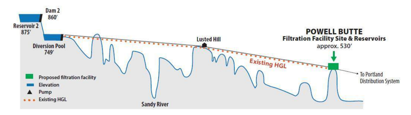
Figure 7. Illustration showing a filtration facility located at Powell Butte relative to the HGL. Note the facility is very close to the HGL and would have gravity flow.

A facility at Powell Butte could be placed close to, or just below, the HGL, maximizing gravity flow to the facility (see Figure 7). However, pumping would be required to send water back up to retail and wholesale customers connected to the conduits between Headworks and Powell Butte, including the existing 16-inch Lusted Road Distribution Main connected to Conduits 2 and 4 at Lusted Hill. This would involve not only a pump station, but new pump mains to deliver water approximately 18–20 miles back east, at a significant cost and effort. Although Powell Butte passed the HGL criterion, it has significant drawbacks related to pumping filtered water back upstream (east) to customers.