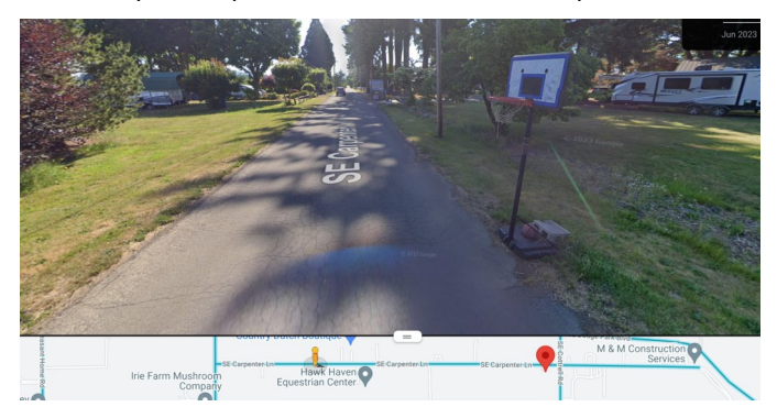
Mid-way on Carpenter Lane—Basketball hoops on the street!