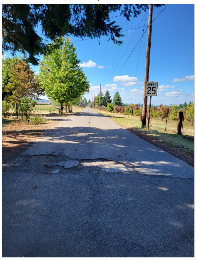
The southeast corner at the intersection of Cottrell Road & Dodge Park Boulevard, looking north.