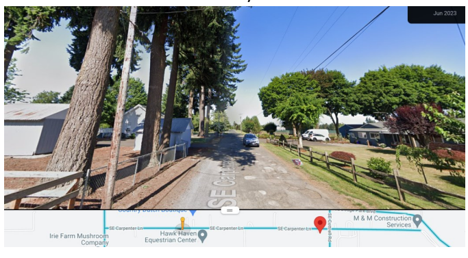
Mid-way on Carpenter Lane, looking west. Homes on either side with shrubs, trees and fences to the edge of the lane. Cars drive slow and around potholes because no concern with heavy traffic!