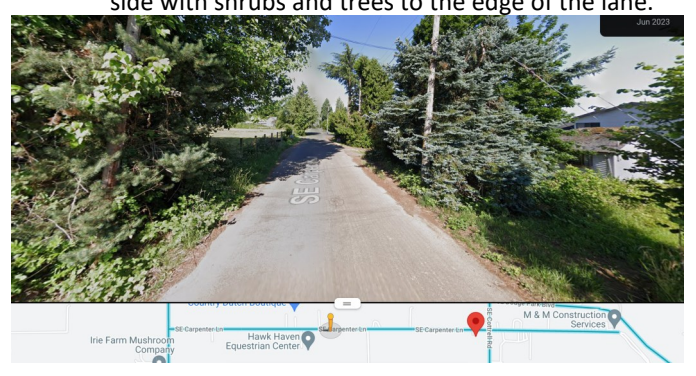
Mid-way on Carpenter Lane, looking west. Homes on either side with shrubs and trees to the edge of the lane.