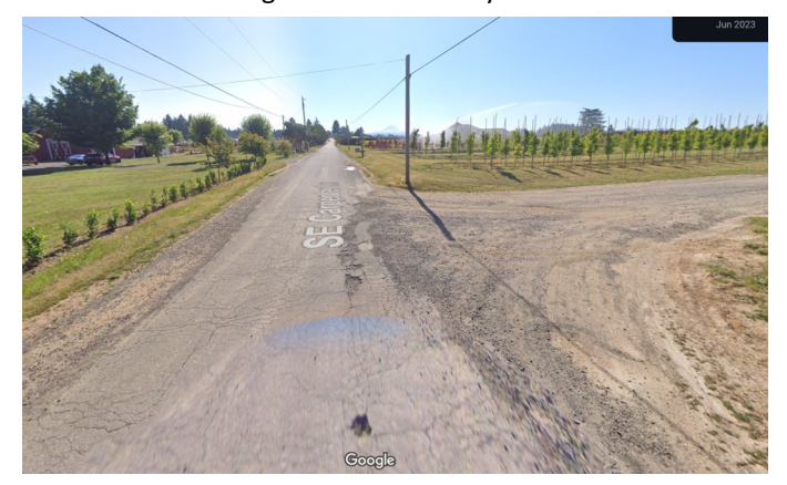
Mid-way on Carpenter Lane, looking east. Pot-marked lane and gravel from nursery access.