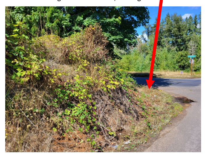
The southwest corner at the intersection of Cottrell Road & Dodge Park Boulevard, looking north