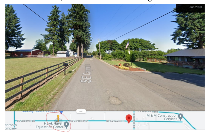
Mid-way on Carpenter Lane, looking west. Homes on either side with shrubs, trees and fences to the edge of the lane.