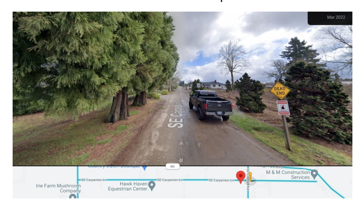
Looking east on Carpenter from the intersection of Carpenter and Cottrell towards where the plant will be built.