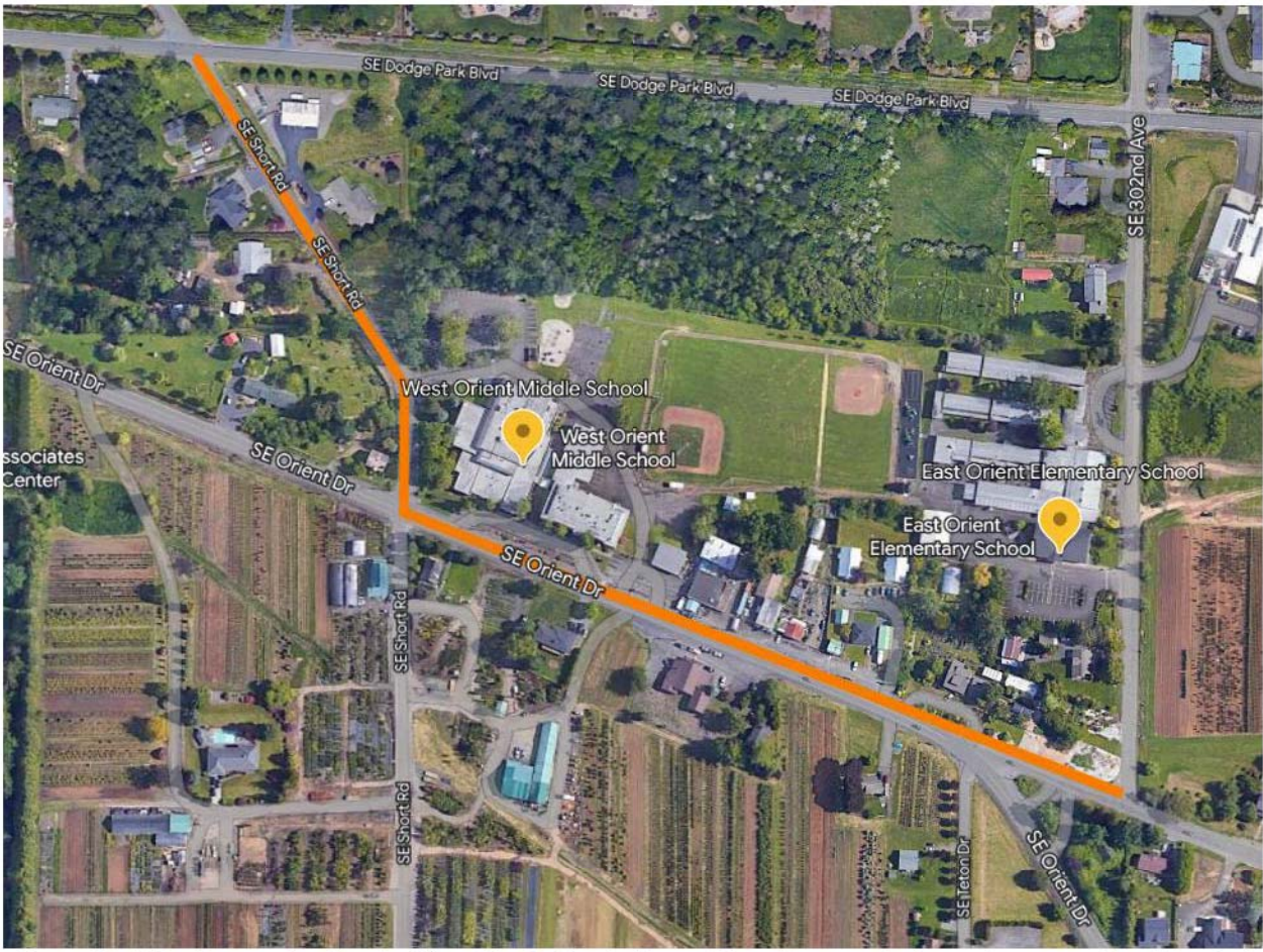
Figure 20. Filtration construction traffic will be instructed to avoid road segments shown in orange: Short Road at all times, Orient Drive truck traffic on school days, and Orient Drive craft labor commuter traffic at specific times on school days.