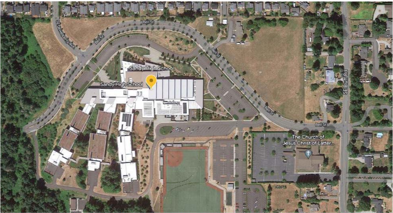
Figure 9. The main entrance to Sandy High School is off Bell Street.

Sandy High School is about five driving miles south-southeast of the facility site. The main entrance to the school is on Bell Street (Figure 9 and Figure 10), which can be accessed from Bluff Road. Because this segment of Bluff Road has both sidewalks and bike lanes as shown below, no use restrictions of Bluff Road are proposed for filtration construction traffic.