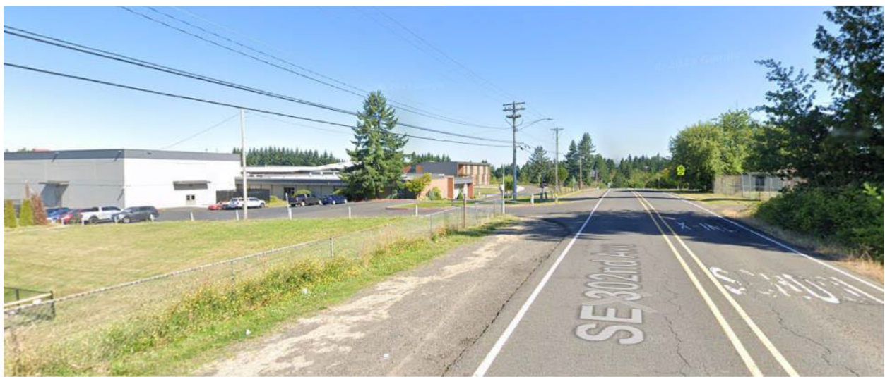
Figure 13. Traveling north on 302nd Avenue with Sam Barlow High School visible on the left.

Sam Barlow High School is about three driving miles from the facility site. The school can be accessed from 302nd Avenue and from Lusted Road (Figure 13 and Figure 14).