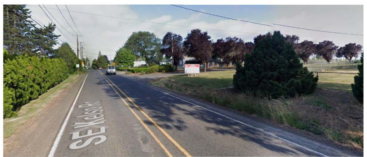
Figure 7. Approaching entrance to Kelso Elementary School (right) on Kelso Road from the east.

Kelso Elementary School is about five driving miles south-southwest of the facility site. The school is accessed from a driveway off Kelso Road (Figure 7). Filtration construction traffic will be instructed to avoid the segment of Kelso Road between Orient Drive and Eklund Avenue (Figure 8) on school days.