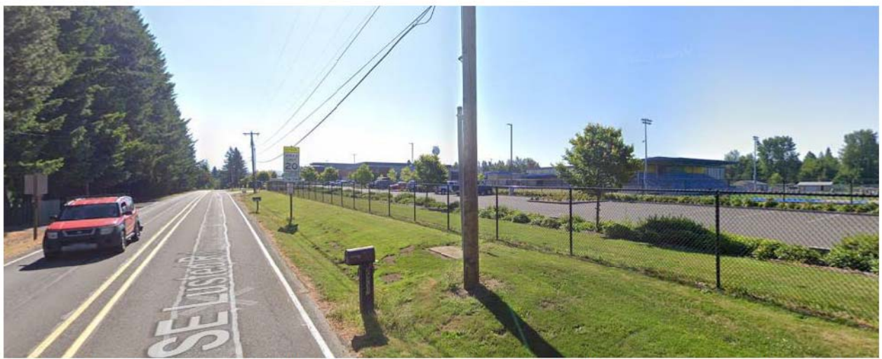
Figure 14. Traveling east on Lusted Road with Sam Barlow High School and main parking area visible on right.