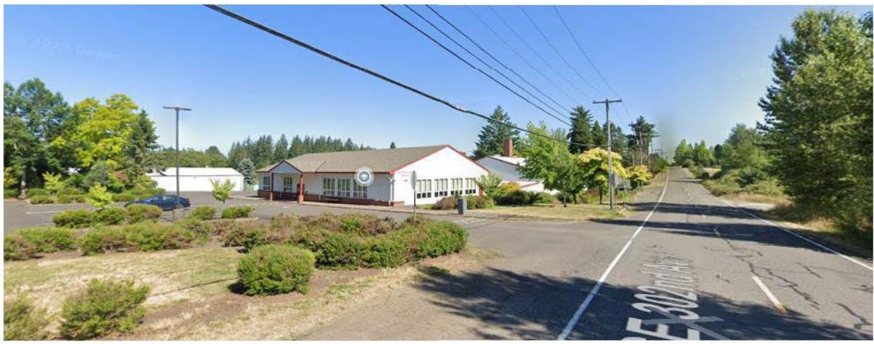
Figure 16. Traveling north on 302nd Avenue with East Orient Elementary School parking visible on the left.

East Orient Elementary School is about 2.5 driving miles from the facility site. The school is accessed from 302nd Avenue (Figure 16). Filtration construction traffic will be instructed to avoid use of 302nd Avenue between Orient Drive and Dodge Park Boulevard (Figure 17).