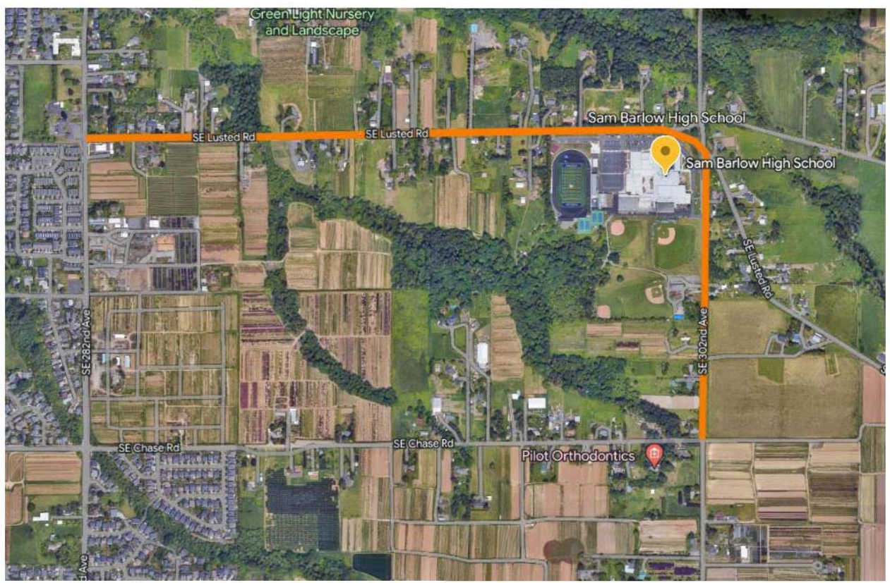
Figure 15. Filtration construction traffic will be instructed to avoid road segments shown in orange: truck traffic on school days and craft labor commuter traffic at specific times on school days.

Filtration construction truck traffic will be instructed to avoid Lusted Road between 302nd Avenue and 282nd Avenue and to avoid 302nd Avenue between Chase Road and Lusted Road on school days (Figure 15). Construction craft labor commuter traffic will be instructed to avoid these same road segments for two hours each school day as follows: 30 minutes before and after school start times and 30 minutes before and after school end times.