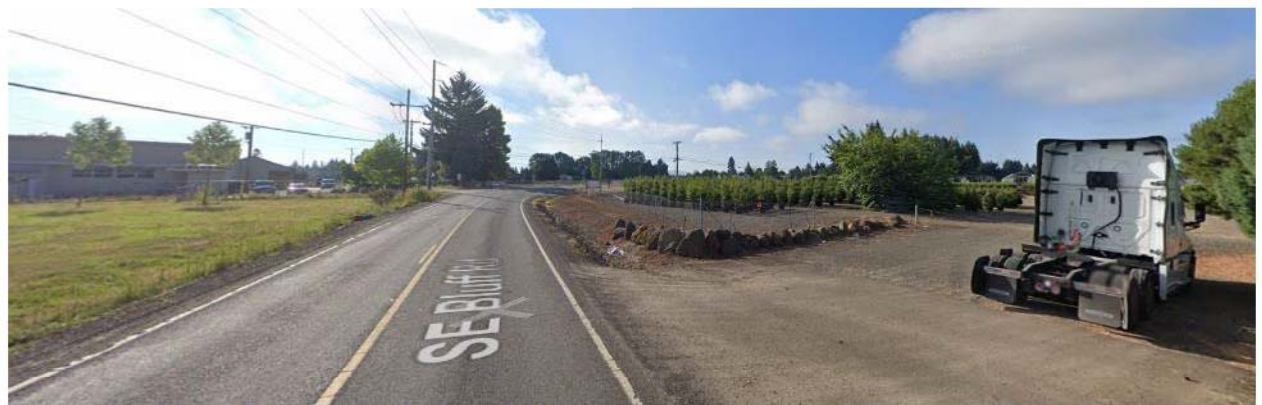
Figure 5. Approaching Proctor Road on Bluff Road from the west with school visible (left).