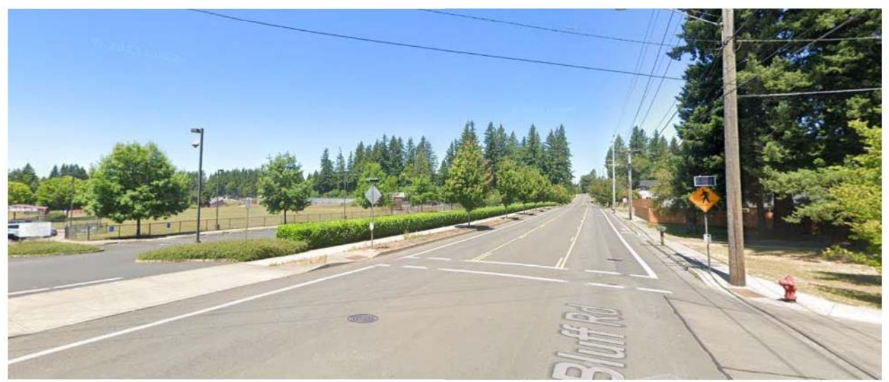
Figure 12. Traveling north on Bluff Road near athletic field parking (left) with pedestrian crossing, sidewalks, and bike lane visible.

Parking for Oregon Trail School District athletic fields near Sandy High School can also be accessed from Bluff Road. Bluff Road includes sidewalks, a signaled pedestrian crossing, and bike lanes in this area (Figure 12).