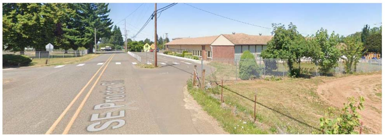
Figure 3. Approaching Oregon Trail Academy on Proctor Road from the east.