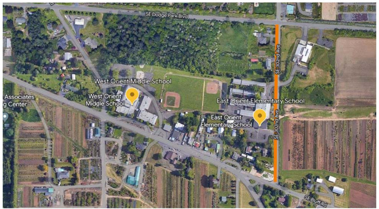
Figure 17. Filtration construction traffic will be instructed to avoid the road segment shown in orange on school days.