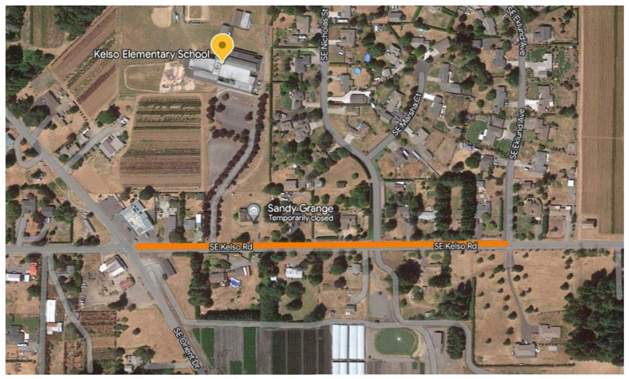
Figure 8. Filtration construction traffic will be instructed to avoid use of the road segment shown in orange on school days.