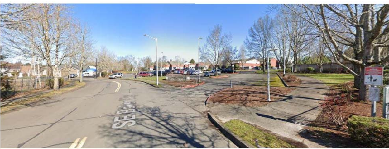
Figure 21. Approaching Kelly Creek Elementary School (right) on Baker Way from the south with sidewalks visible.

Kelly Creek Elementary school is about five driving miles west of the facility site. The school is accessed from Baker Way (Figure 21). Filtration construction traffic will be instructed to avoid Baker Way on school days (Figure 22).