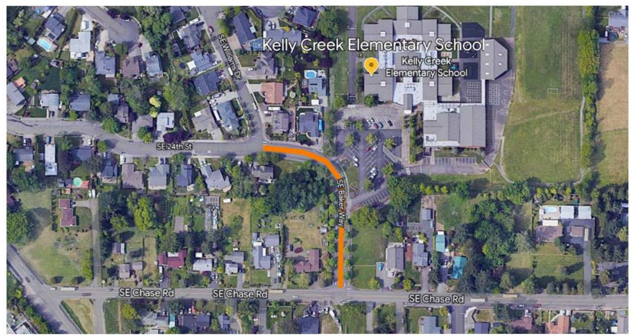
Figure 22. Filtration construction traffic will be instructed to avoid road segments shown in orange on school days.