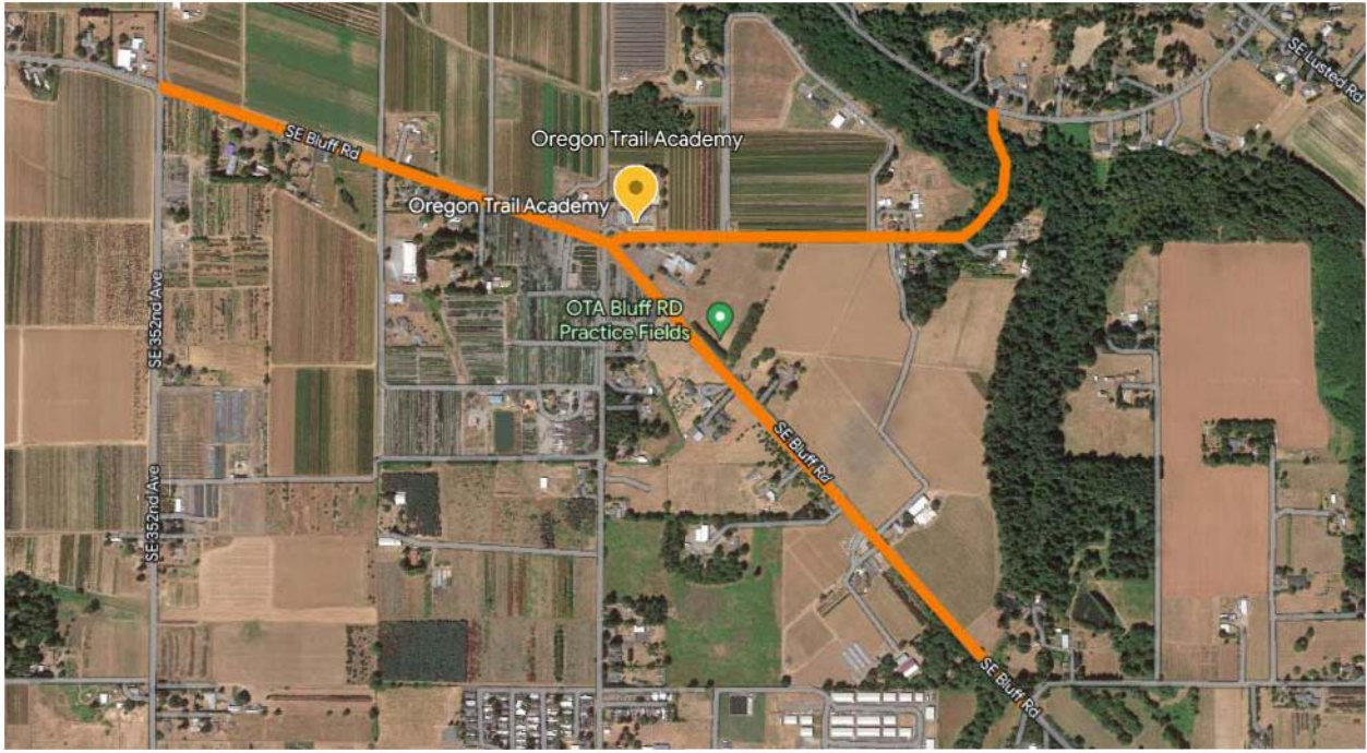
Figure 6. Construction traffic will be instructed to avoid use of road segments shown in orange: Proctor Road on school days and Bluff Road at specific times on school days.