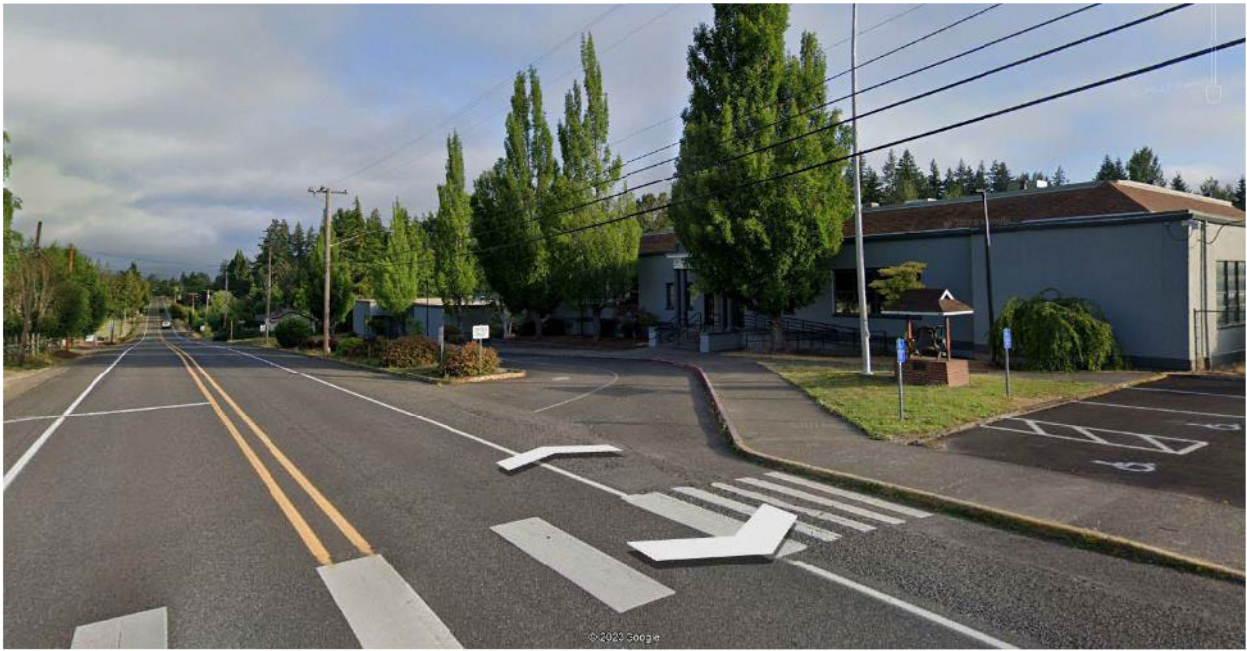
Figure 18. Approaching West Orient Middle School one-way driveway off Orient Drive from the east.

West Orient Middle School is about three driving miles from the facility site. The school can be accessed from Orient Drive (Figure 18) and from Short Road (Figure 19). Filtration construction truck traffic will be instructed to avoid use of Orient Drive between Short Road and 302nd Avenue on school days and to avoid use of Short Road between Orient Drive and Dodge Park Boulevard at all times (Figure 20). Construction craft labor commuter traffic will be instructed to avoid use of Short Road between of Orient Drive for two hours each day: 30 minutes before and after school start times and 30 minutes before and after school end times on school days.