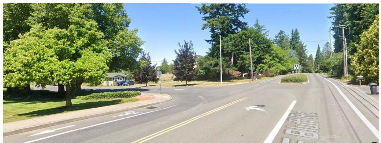
Figure 11. Approaching Bell Street (left turn) traveling north on Bluff Road with sidewalks and bike lane visible.

The segment of Bluff Road near the intersection with Bell Street includes sidewalks and bike lanes (Figure 11).