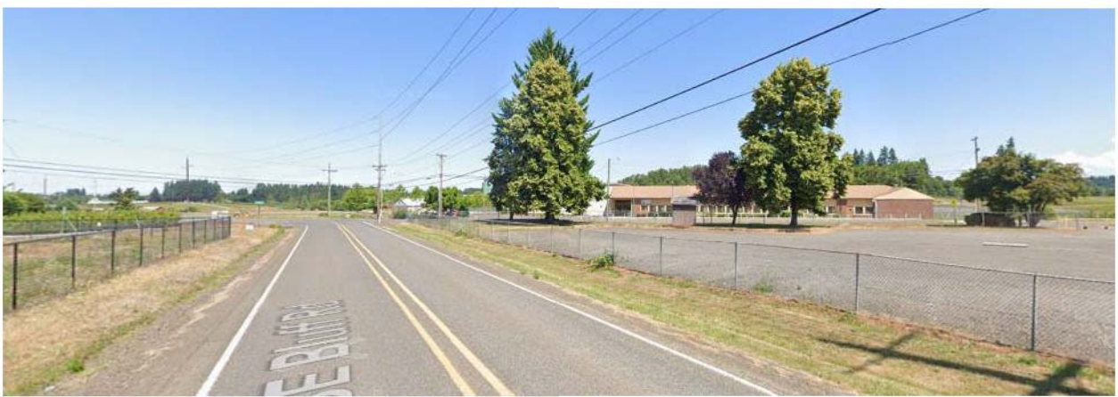
Figure 4. Approaching Proctor Road on Bluff Road from the south with school visible (right).