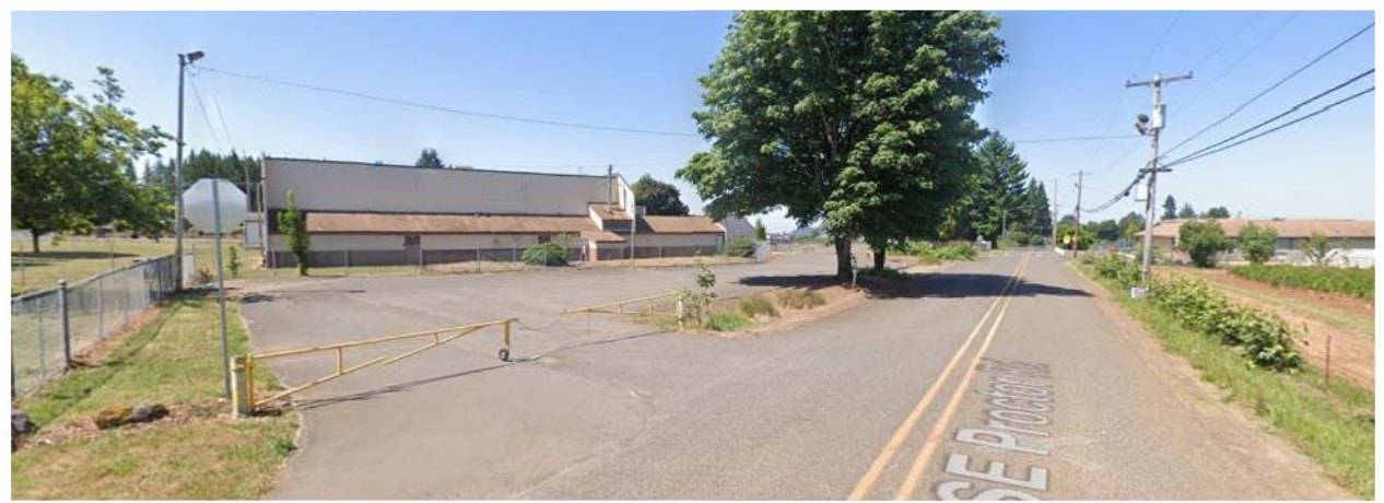
Figure 2. Approaching Oregon Trail Academy on Proctor Road from the east.

Oregon Trail Academy is just east of the intersection of Bluff Road and Proctor Road. The school is accessed from Proctor Road (Figure 2 and Figure 3) near Bluff Road (Figure 4 and Figure 5). Filtration construction traffic will be instructed to avoid Proctor Road between Bluff Road and Dodge Park Boulevard (Figure 6) on school days. In addition, construction truck and craft labor commuter traffic will be instructed to avoid Bluff Road between 352nd Avenue and Bear Creek Lane for two hours each school day as follows: 30 minutes before and after the Oregon Trail Academy school start time and 30 minutes before and after school end time.