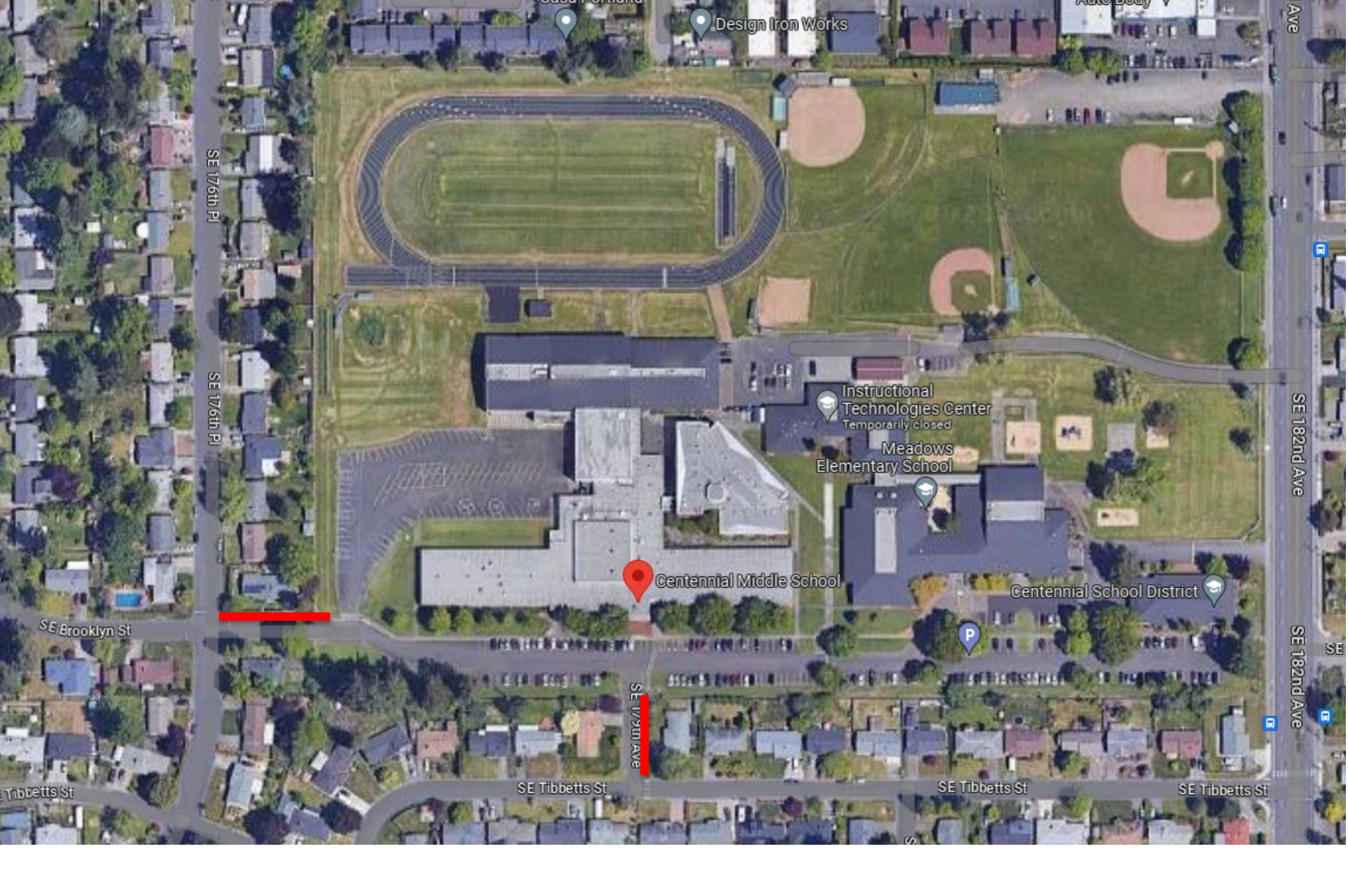
Centennial MS Sidewalk Project CRESHAM