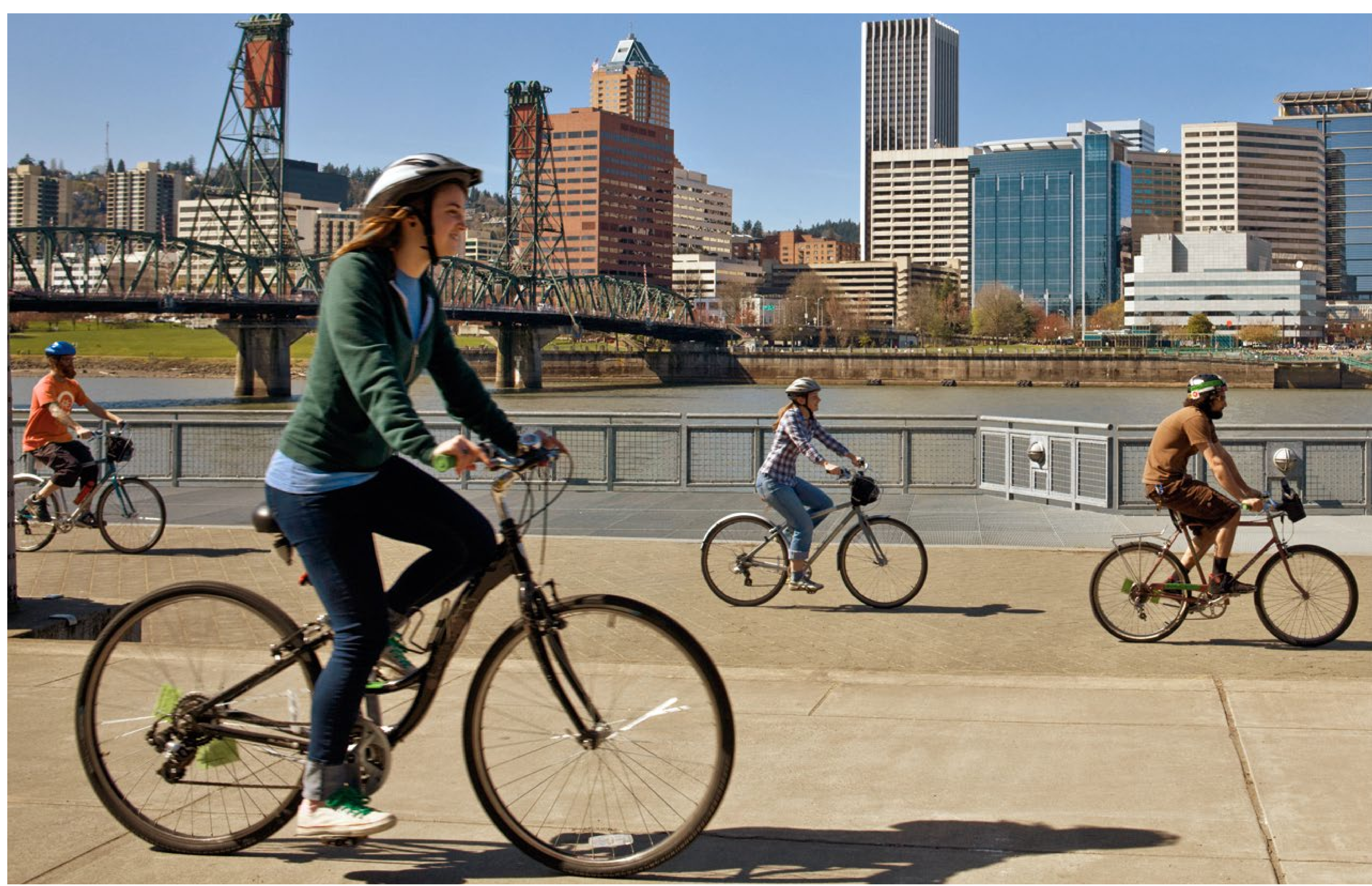
ENGAGING THE LOCAL BICYCLE AND PEDESTRIAN COMMUNITY