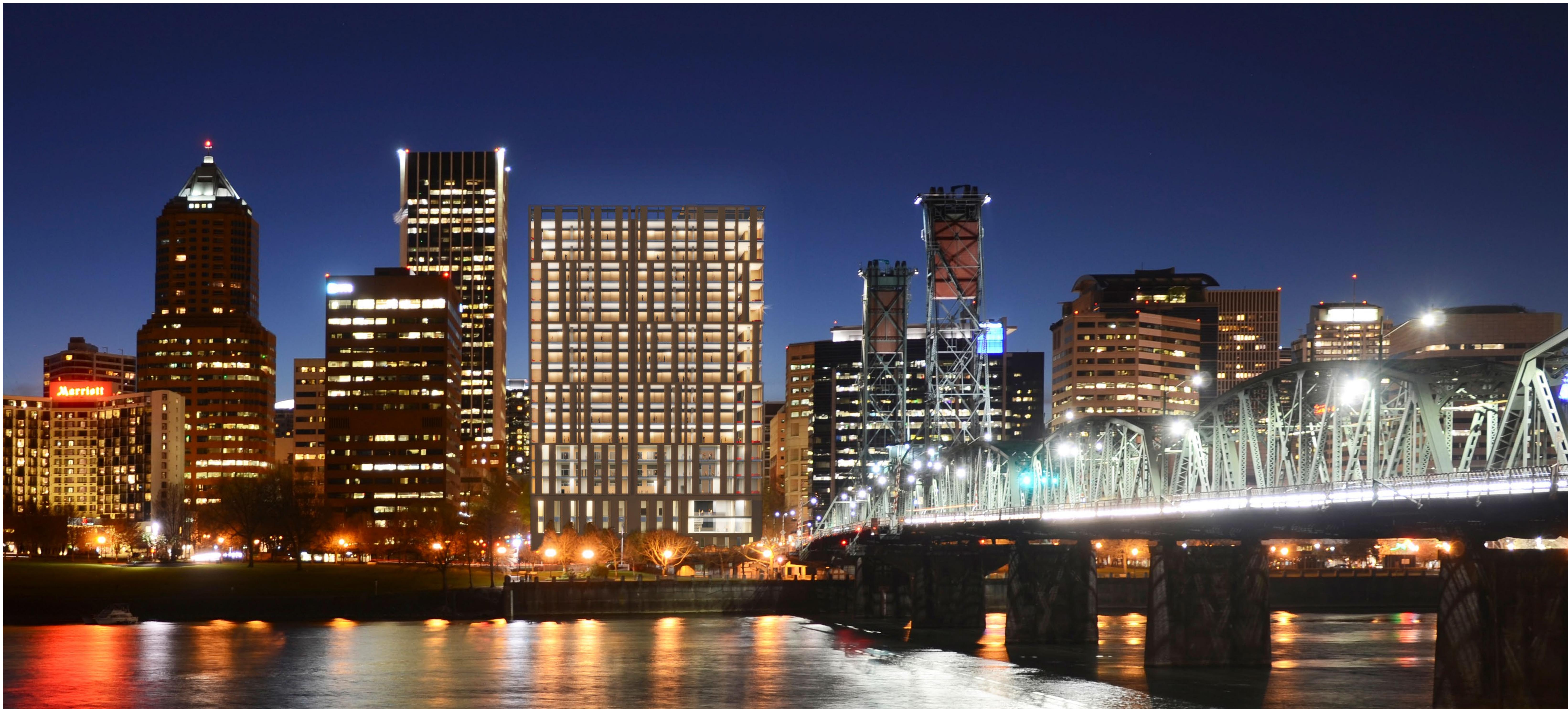
NIGHT IMAGE FROM EAST SIDE OF THE HAWTHORNE BRIDGE

NOTE: ALL DESIGN INFORMATION IS IN DRAFT FORM AND SUBJECT TO CHANGE