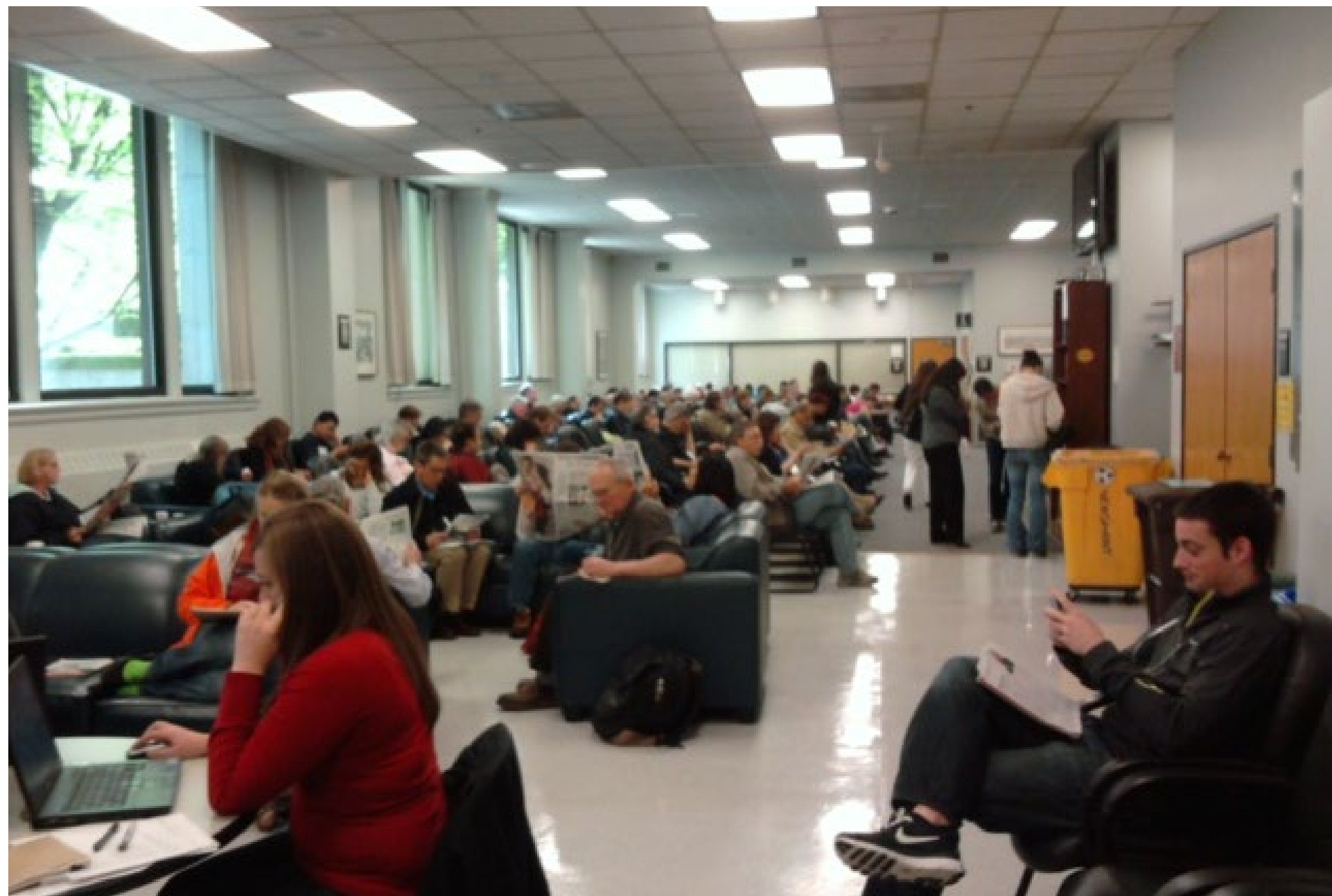
EXISTING JURY ASSEMBLY