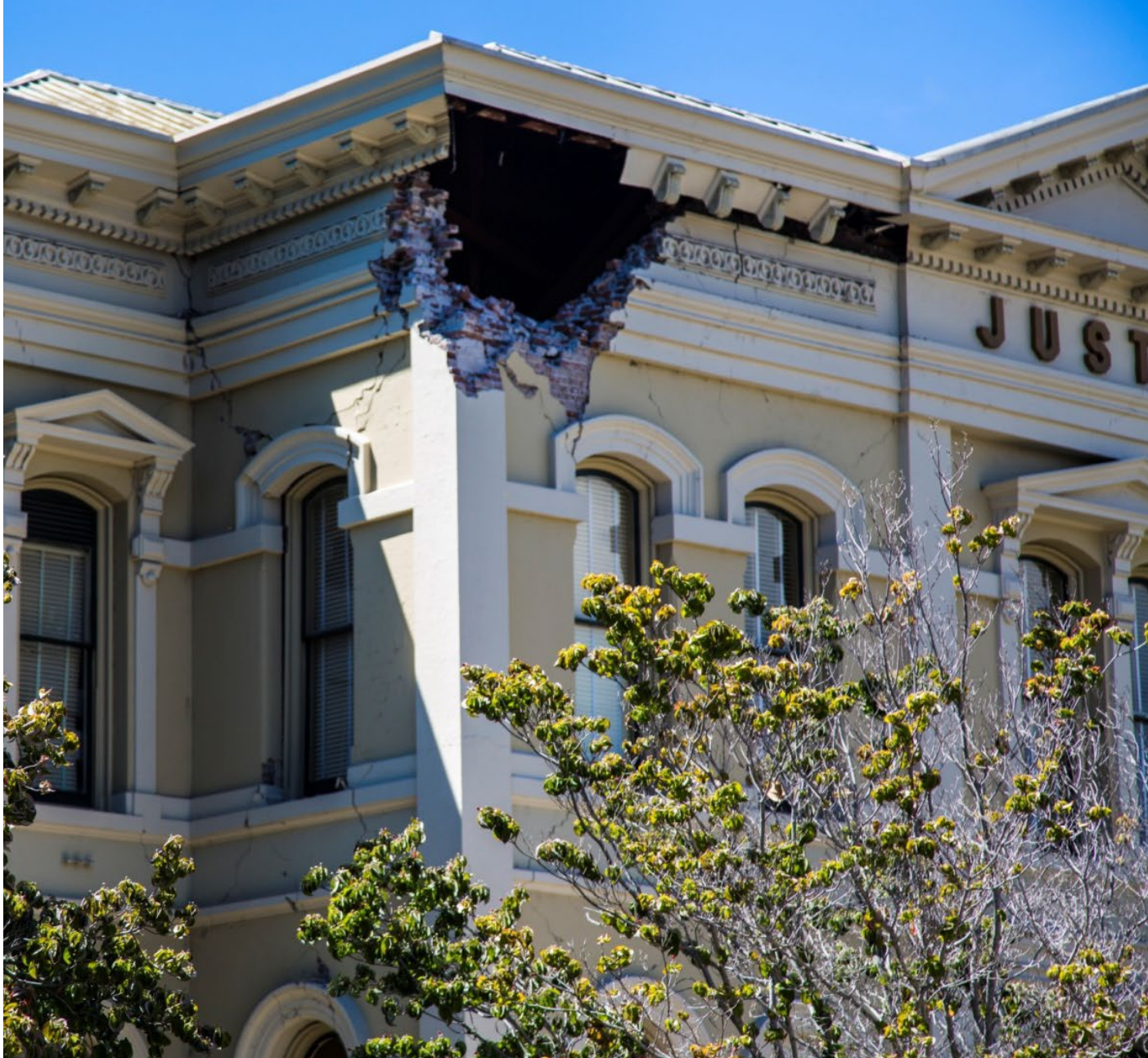
EXAMPLE OF POSSIBLE DAMAGE