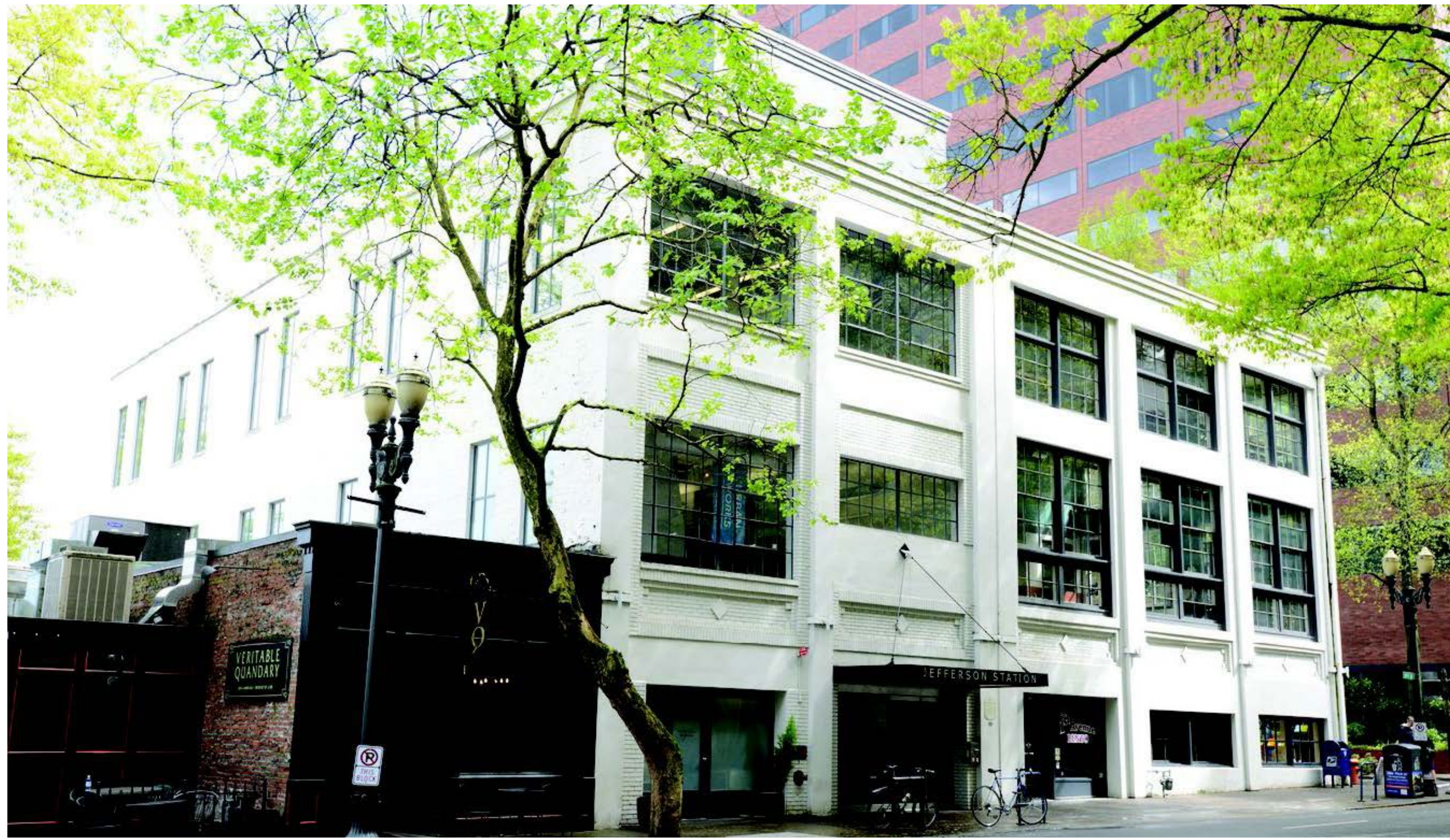
HISTORIC JEFFERSON STATION