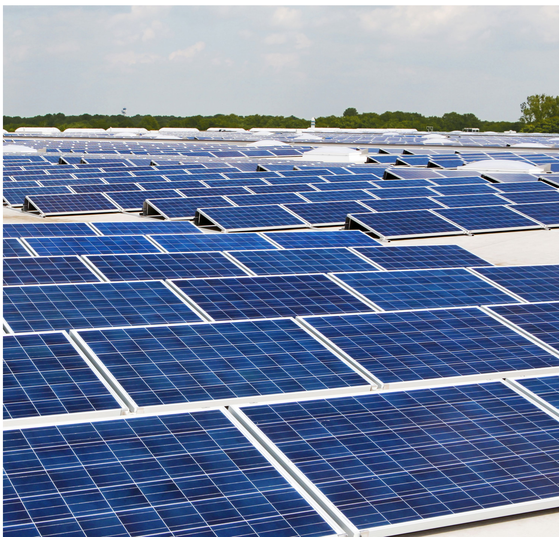
SOLAR PANELS EXAMPLE