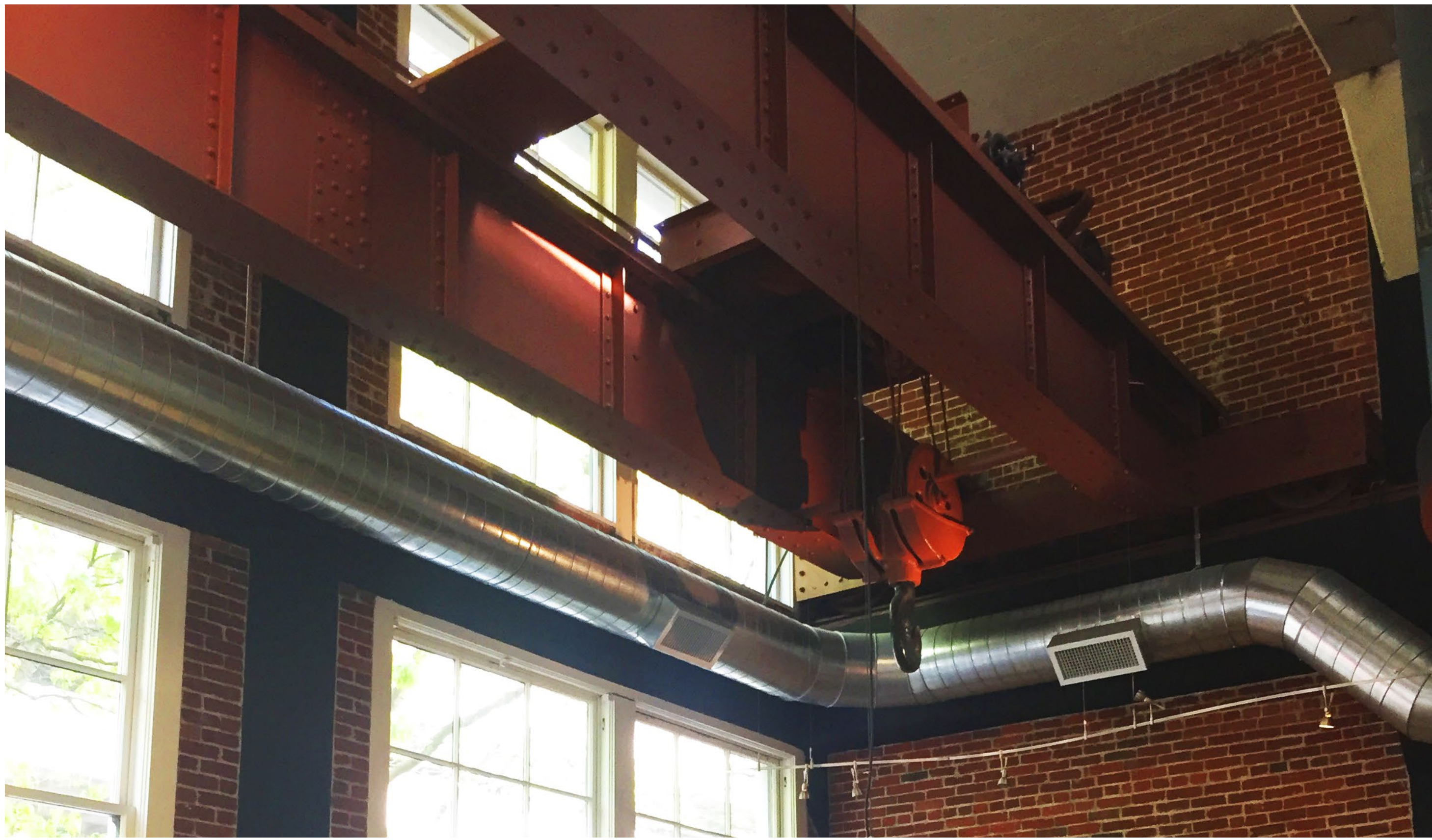
PRESERVING HISTORICAL CHARACTER