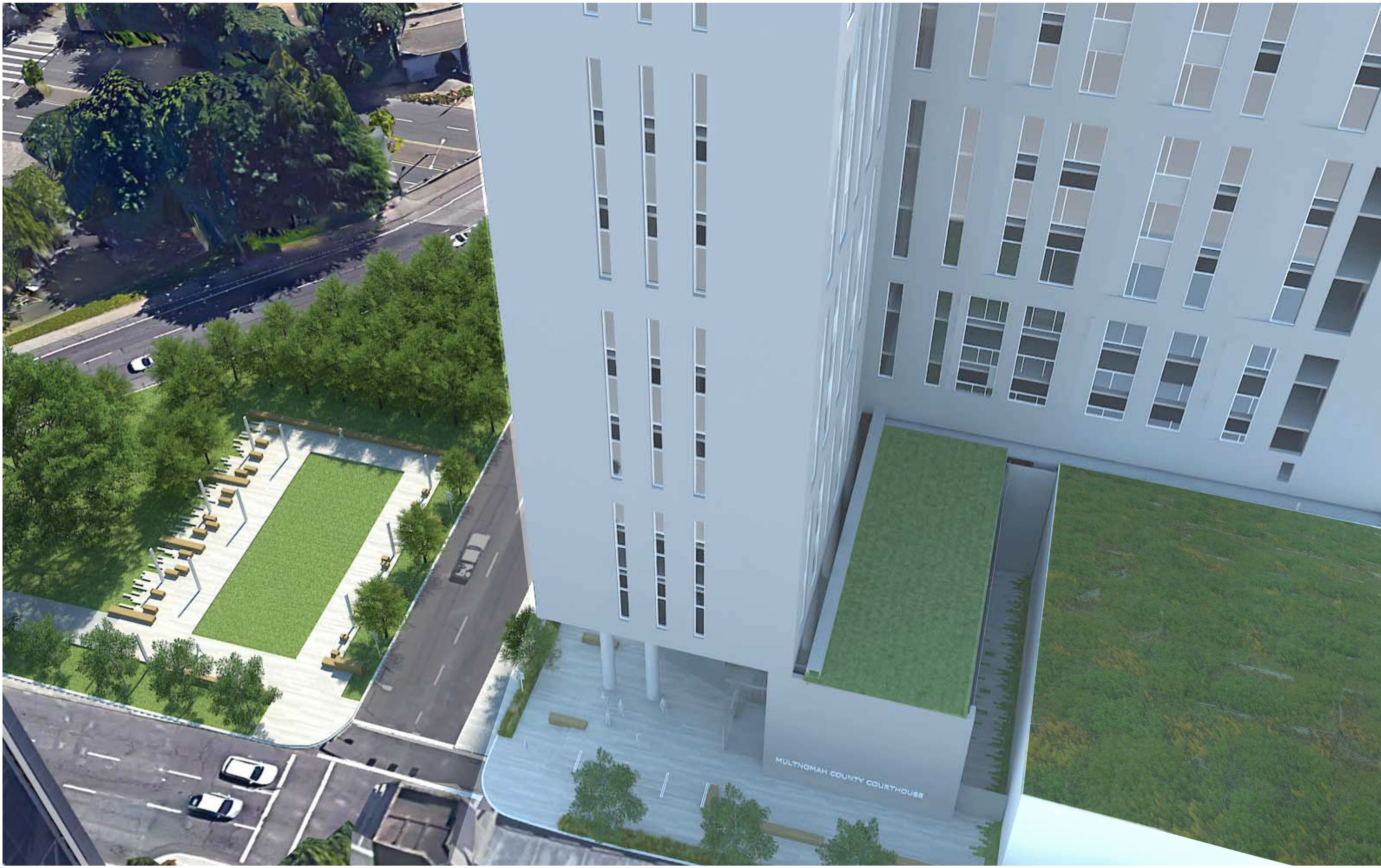
VIEW OF PROPOSED GREEN ROOF