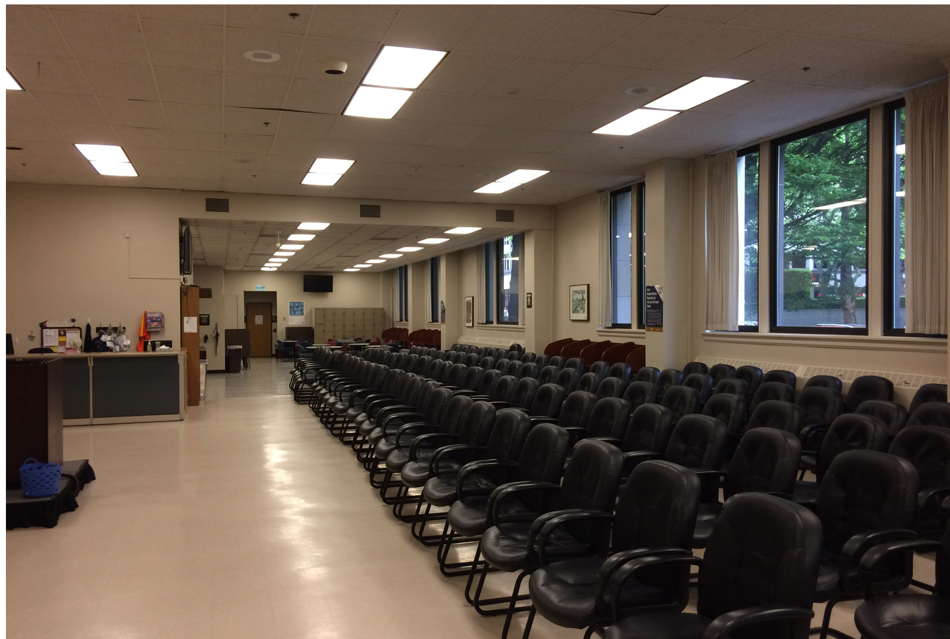
EXISTING JURY ASSEMBLY