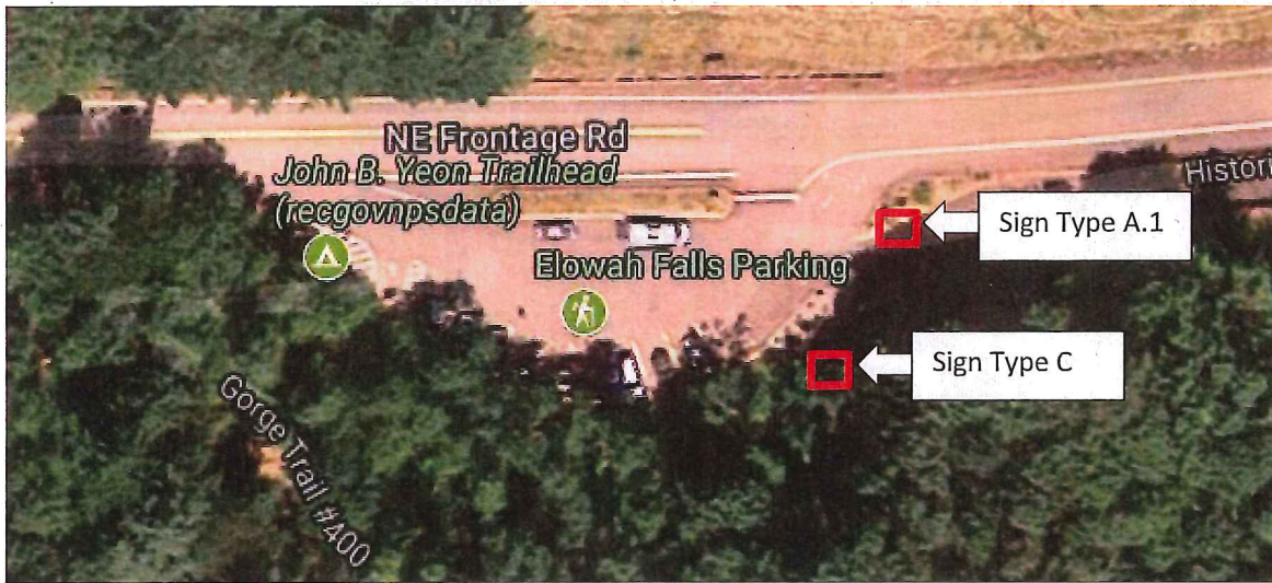
Figure 10. Signs proposed at the John B. Yeon Trailhead.