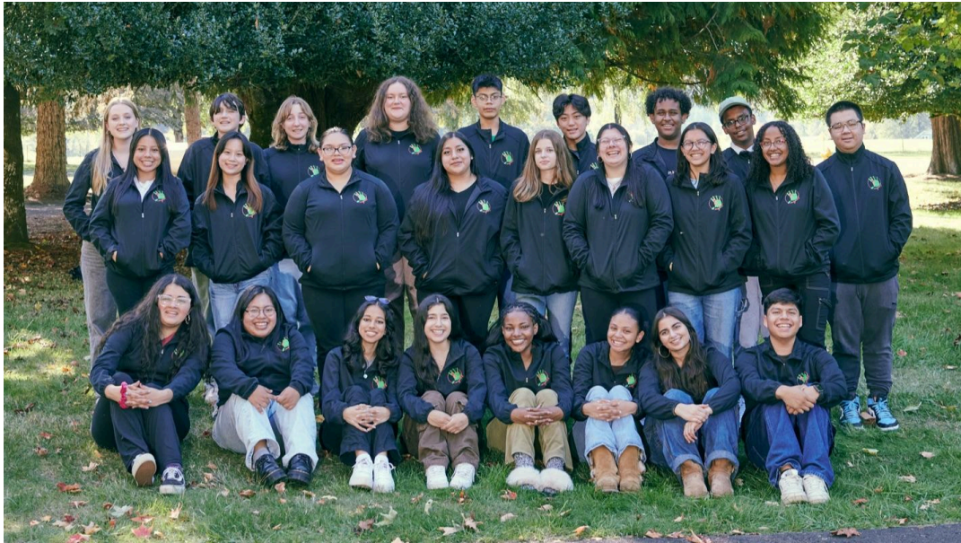
2023-2024 Commission Members

DUE DATE: MONDAY, APRIL 15, 2024 at 11:59 p.m.