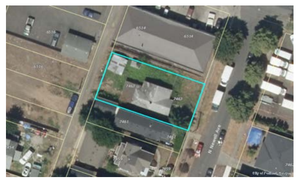
PROPERTY #1 N PORTLAND HOUSE 7463 N NEWELL AVE PORTLAND, OR 97203 Tax Account: R227590 OPEN THURSDAY APRIL 4, 2019 10:30 am – 11:15 am MUST BRING FLASHLIGHT AND PERSONAL PROTECTIVE EQUIPMENT