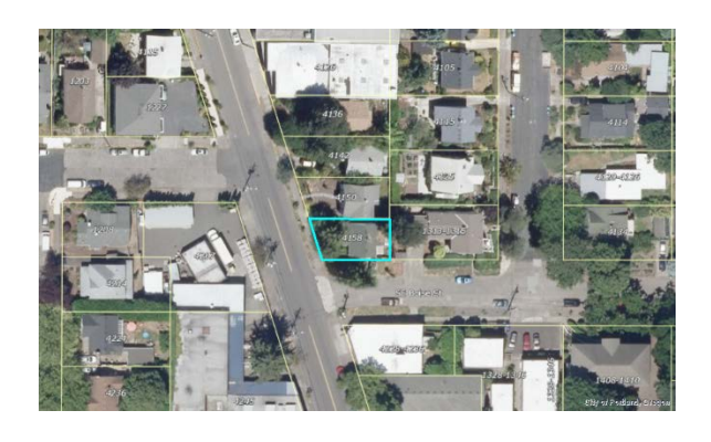
PROPERTY #9 SE PORTLAND HOUSE 4158 SE MILWAUKIE AVE PORTLAND, OR 97202 Tax Account: R117868 Minimum Bid: $175,000 Earnest Money: $35,000