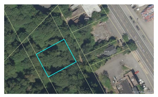
PROPERTY #5 NW PORTLAND LAND 2940 NW SUSSEX PORTLAND, OR 97210 Tax Account: R117666 Minimum Price: $5,000 Earnest Money: $1,000