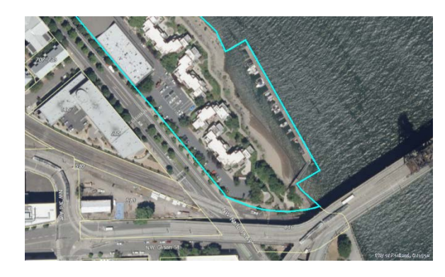
PROPERTY #1 N PORTLAND HOUSE 7463 N NEWELL AVE PORTLAND, OR 97203 Tax Account: R227590 Minimum Price: $125,000 Earnest Money: $25,000