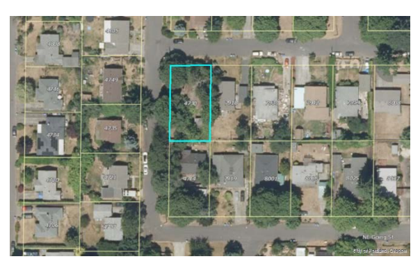
PROPERTY #8 NE PORTLAND HOUSE 4730 NE 79TH AVE PORTLAND, OR 97218 Tax Account: R178608 Minimum Price: $100,000 Earnest Money: $20,000