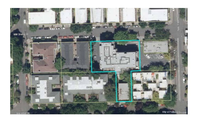
PROPERTY #6 NW PORTLAND CONDO 1930 NW IRVING ST, Unit 3 PORTLAND, OR 97209 Tax Account: R532730 Minimum Bid: $275,000 Earnest Money: $55,000