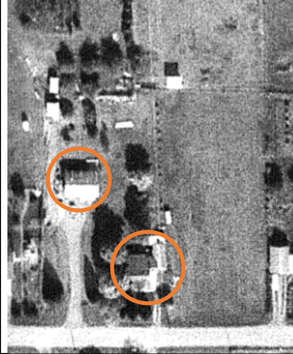
1977 Aerial Imagery