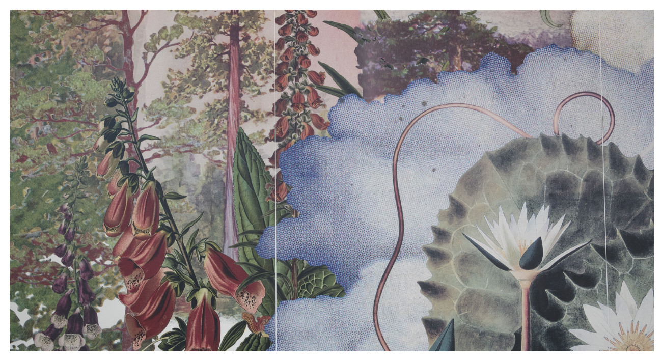
Artwork at New Health Department Headquarters

We found the division's ability to provide quality care was at risk because of the number and pace of significant changes mandated by the state. The state had not adequately funded all of these changes and has put a complex funding system into place. The destabilizing impact of these changes and funding pressure at the county level had resulted in high caseloads and turnover, case manager strain and burnout, morale issues, and complaints from clients and their families.