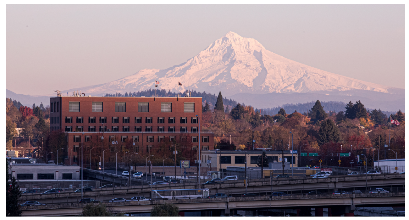
Mt. Hood behind the Multnomah Building

We found professional monitoring of traditional risk management functions. However, we found the county was not using the most effective approach to overall risk management, Enterprise Risk Management (ERM). Implementing ERM would benefit the County by focusing management's attention on the organization's most significant risks, improving its ability to meet its mission, goals and objectives, and supporting more effective use of taxpayer dollars.