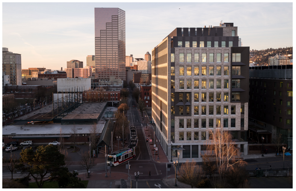
Health Department Headquarters

We found that turnover should be addressed, as it reduces patient access to providers, increases the workload on remaining providers, and is costly. Integrated Clinical Services also needs a high-level financial decision-maker as part of the leadership team.