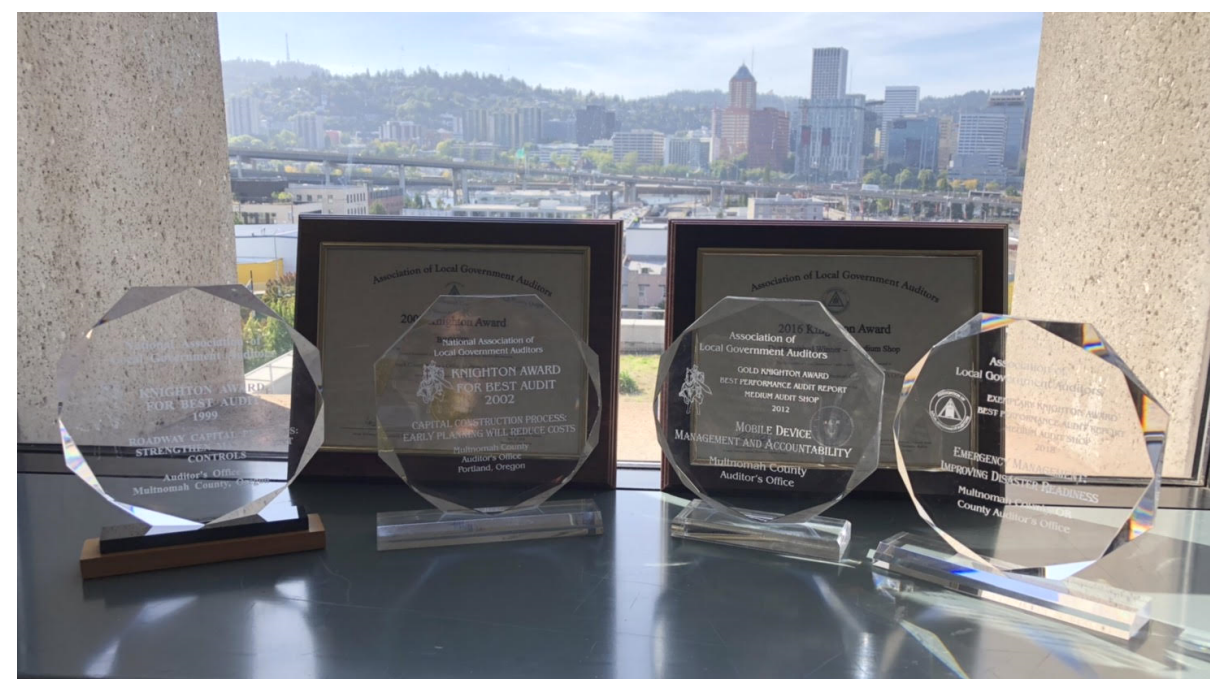
In addition to the most recent award, the Auditor's Office has won five other Knighton Awards in previous years.

The judges praised the audit for uncovering, "potential hazards that could threaten the County and then proactively makes recommendations on options to strengthen Emergency Management in advance of future disasters."