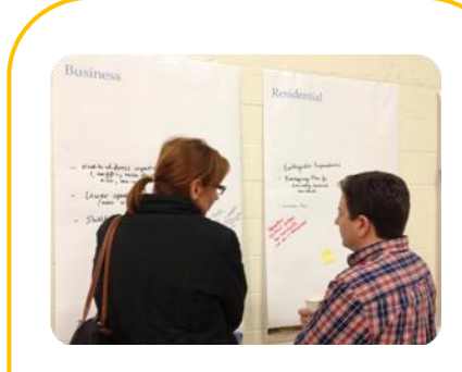
Visions were collected on the walls and questionnaires.